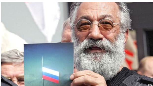
Artur Chilingarov, head of Russian expedition to the Arctic-2007, shows picture of Russian flag in the seabed below the North Pole in August 2007.

In recent years, Russia has become active in its military activities in the Arctic Ocean, protecting its rights to seabed resources, controlling the Northeast Passage to prevent foreign intervention, and defending the sea lane to East Asia (OPRF 2012). A statement of principles, approved by then Russian President Dmitry Medvedev in 2008, regards the Arctic as a strategic resource base of primary importance to Russia. Foreseeing the possible rise of tensions developing into military conflict, the document prescribes “building groupings of conventional forces in the Arctic zone capable of providing military security in different militarypolitical conditions” ( Rossiyskaya Gazeta 2009).