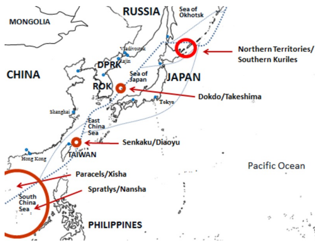
Figure 2: Major Sea Lanes Connecting the Arctic and East Asia, and the Disputed Territories

since the collapse of the “bubble economy,” followed by the “lost decade” and the Fukushima disaster.