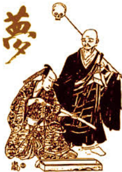
Takuan Sōhō with samurai disciple

A cursory glance at the writings of Zen scholars like D.T. Suzuki, with his proffered "unity of Zen and the sword," suggests that at least in medieval Japan there is no reason to be surprised at the presence of Zen masters on the battlefield. A closer reading, however, reveals this was not the case. That is to say, Zen masters like the famous Takuan Sōhō (1573–1645) served as spiritual advisors to the samurai class, not as warriors themselves. The closest that Zen masters came to engaging in warfare are figures like Yamamoto Jōchō (1659-1719), author of the Bushidō classic, Hagakure (Hidden under the Leaves), or Suzuki Shōsan (1579–1655) who urged his disciples to develop a warrior's fortitude. Both of these latter Zen masters had earlier been samurai and entered the priesthood only after retirement, i.e., upon reaching an age when they were no longer fit for battle.