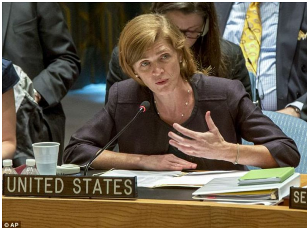
Samantha Power at the United Nations

In a New York Times op-ed following the public's rejection of president Barack Obama's call for air strikes on Syria, Michael Ignatieff, a professor at the Harvard Kennedy School and former leader of the Canadian liberal party, sought to reaffirm the doctrine of humanitarian intervention, stating that while the public had become weary over the failure of wars in Iraq, Afghanistan and Libya, Western democracies had a responsibility to protect civilians when they are threatened with mass killing. In his view, the use or threat of force may be "illegal but legitimate," and the US sometimes needs to "go at it alone to stop atrocity crimes.....Rebuilding popular democratic support for the idea of our duty to protect civilians when no one else can or will," thus represents "a critical challenge in the years ahead." 1