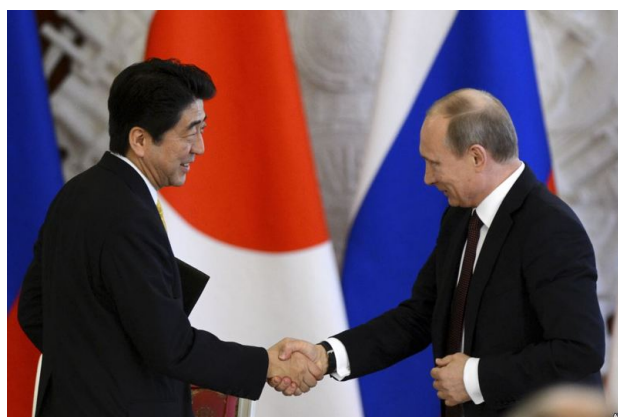
Abe and Putin meet April 29, 2013

Abe, however, has sought improved ties with resource-rich Russia and "has met with Vladimir Putin five times since coming to power in 2012, more than he has met any other foreign leader." 6 He even attended the Sochi Olympics whereas Obama and the other G-8 leaders boycotted that event. Abe's visit to Russia in April 2013 was the first by a Japanese prime minister since Mori Yoshiro's in 2002. Putin has also visited Japan and said he is ready to resolve the "Northern territories" issue. Putin clearly wants Russia to remain open to the world economy and has long encouraged Japanese investment in Siberian development projects. Both leaders share a common goal of seeking to revitalize national pride after suffering great national catastrophes. For Abe the catastrophe was Japan's defeat in 1945 and the San Francisco peace settlement; for Putin it was the breakup of the Soviet Union, followed by the economic collapse of the 1990s. On this score, the two men probably felt much closer to one another than they did to Obama.