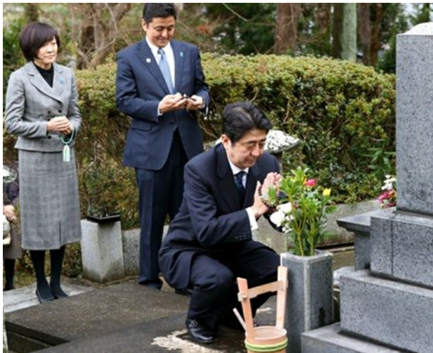
Abe prays before the family grave of Kishi, Dec 22, 2013.

A new era in the political history of postwar Japan has begun, with changes in the Japan-U.S. relationship likely to follow in the years ahead. For even in a land of patrimonial politics Prime Minister Abe is not a typical politician. His economic policies set him apart. So too does his tie to his grandfather Kishi Nobusuke, who was imprisoned after World War II as an unindicted war criminal. When Kishi emerged from prison he launched the first attack from the right on the Tokyo international war crimes tribunal. Later as prime minister, Kishi reshaped Japan's postwar order and in January 1960 renegotiated the one-sided Japan-U.S. security treaty: the military alliance imposed on the occupied nation by the United States, over historically unprecedented popular opposition. Abe agreed with his grandfather's view that relations with the U.S. should be strengthened, and that the postwar constitution needed to be rewritten. He resolved to follow Kishi's lead and prioritize constitutional revision.