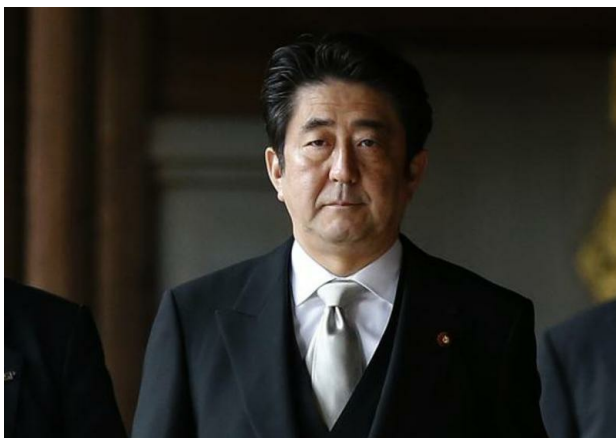
Abe visits Yasukuni Shrine, Dec 26, 2013

When Abe returned to power in 2012, American leaders and corporate media praised his bold economic policies but felt uneasy about his exercise of independent judgment in foreign policy. On the anniversary of his resuming office, Abe visited Yasukuni Shrine, the unique Shinto religious institution that enshrines the spirits of Japan's 2.4 million war-dead, together with the spirits of fourteen wartime leaders found guilty of grave offenses by the Tokyo tribunal. Chinese and South Korean media protested his action and some Japanese citizens filed a lawsuit claiming his visit violated the constitution's separation of politics and religion. Prior to his first meeting with President Barack Obama at the White House, Abe postponed a scheduled return to Yasukuni. But shortly afterwards he revisited the shrine, ignoring the advice of U.S. Assistant Sec. of State Richard Armitage and Vice President Joe Biden to stay away from paying official homage there. Simultaneously, he angered not only the Chinese and Koreans (North and South) but also the U.S. 1