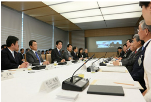
The Abe cabinet discusses growth strategy

In the early 1990s, Japan executed a managed drawdown of regular employees as firms struggled to cope with effects of the collapse of the famous asset bubble. The concurrent, sharp rise in non-regulars -- from about 10% in 1990 to about 40% of the labor force today (and more than 50% of younger workers (Morioka 2013)) -- has given rise to insecurity and anxiety. 1 Competition for good regular posts is intense; some posts, while regular, are not good, and about a fifth of non-regulars want regular employment but can't find it (MHLW 2013, 30-32). Only 41.5% of available jobs are regular positions (Mainichi Shinbun 2014). Meanwhile, regular workers may face demands for increased productivity that diminish the status advantages of regular employment. The status gap between workers in the two types of employment, however, still represents differential life chances -- time binds and work-life imbalance for better compensated regulars, and underpay and poor career possibilities for non-regulars, who get less respect and may receive less than a living wage for a nearly 40-hour workweek. The relative poverty of the working poor is linked to delays in marriage and consequent birthrate declines. This growing imbalance in (and between) the lives of regular "core" and non-regular "peripheral" workers is starting to threaten social reproduction and Japan's long-term social stability.