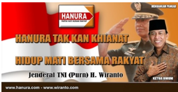
Wiranto's campaign blog emphasises his military service

The current Golkar chairman and presidential candidate is prominent businessman Aburizal Bakrie, another controversial figure since he and his brothers control the huge Bakrie Group founded by their father. Among the conglomerate's many subsidiaries is oil and gas company Lapindo whose drilling triggered a huge mudflow in 2006 that displaced thousands of residents in Sidoarjo, East Java, destroying surrounding homes and farmland. Indonesia's National Commission on Human Rights (Komnas HAM) held the company responsible for the man-made disaster that it deemed a human rights violation. In 2013 Bumi Resources, another Bakrie asset and the largest thermal coal exporter in Asia, was involved in an unsavoury public row with the Rothschild banking dynasty over control of the firm. The Golkar chairman has been upbeat that neither of these scandals will damage his electability but there has been some disquiet within the party over his candidacy. 24