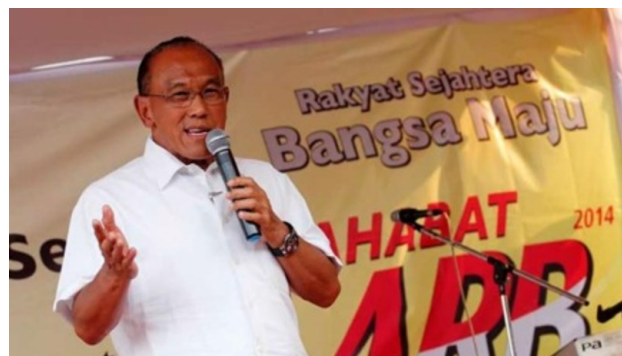
Aburizal Bakrie on the campaign trail

The current Golkar chairman and presidential candidate is prominent businessman Aburizal Bakrie, another controversial figure since he and his brothers control the huge Bakrie Group founded by their father. Among the conglomerate's many subsidiaries is oil and gas company Lapindo whose drilling triggered a huge mudflow in 2006 that displaced thousands of residents in Sidoarjo, East Java, destroying surrounding homes and farmland. Indonesia's National Commission on Human Rights (Komnas HAM) held the company responsible for the man-made disaster that it deemed a human rights violation. In 2013 Bumi Resources, another Bakrie asset and the largest thermal coal exporter in Asia, was involved in an unsavoury public row with the Rothschild banking dynasty over control of the firm. The Golkar chairman has been upbeat that neither of these scandals will damage his electability but there has been some disquiet within the party over his candidacy. 24