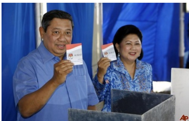
President Yudhoyono and his wife Kristiani vote during the 2009 parliamentary elections

Another distinguishing feature of party politics in Indonesia which has likely contributed to this stabilisation has been the fact that political parties do not usually engage in robust ideological debates with one another. Whilst the lack of substantive issue-oriented political debate raises doubts about the quality of Indonesia's democratic transition, it has enabled the country to avoid the political polarisation that has paralysed party politics in Thailand and elsewhere. Instead Indonesian politics have become increasingly personalistic since the introduction of direct presidential elections in 2004, and the implementation of similarly direct elections for provincial governors, mayors and district heads in 2005. 11 This lack of ideological polarisation has enabled all governments since Wahid's first cabinet of 1999 to be multi-party coalitions where power sharing appears to be the dominant mantra. Yudhoyono continued this trend in 2004 when naming his first United Indonesia Cabinet in which only the PDI-P of the established political parties was not represented. Thus, in the 2009 legislative elections these other parties were unable to effectively challenge Yudhoyono's PD on policy differences. The president repeated this strategy for his second United Indonesia Cabinet, formed at the beginning of his second term, in which again the PDI-P was the only major party not represented. 12