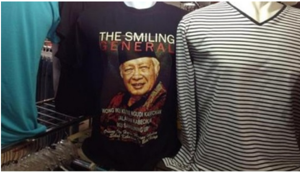
Suharto T-shirts on sale

corruption, reforming the state's labyrinthine bureaucracy, upgrading the country's creaking infrastructure and safeguarding the rights of religious minorities. Current Jakarta governor Jokowi has shown a commitment to clean government and a concern for the poverty-stricken unrivalled by both his predecessors and other presidential hopefuls, and he is the only potential presidential candidate to have arisen from the post-Suharto democratic era. Likewise, pro-poor policies contributed heavily to Yudhoyono's 2009 success. A Jokowi victory would signal a generational change away from politicians who were either military protégés of Suharto or oligarchs who owed their fortunes to him, all of whom can count on backing from the military, the bureaucracy and/or big business. Given that parliament has previously opposed efforts by the Corruption Eradication Commission, the next president will need to forcefully back the agency in order to improve the country's investment climate amid slowing economic growth. Whilst successful as mayor of Solo and governor of Jakarta, Jokowi will find the challenge much bigger at the national level where he will need to balance the demands of coalition partners and the financial backers of any election campaign. Indeed, corruption tends to increase in the run up to elections as parties and candidates seek political funding. 55 However, it is also possible that his wide