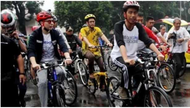
Jakarta governor Jokowi (front right) cycles to work on Fridays

Wiranto kept his post. Prabowo subsequently spent a period of exile in Jordan, before returning to Indonesia to join his brother's resource extraction business and begin his political career.