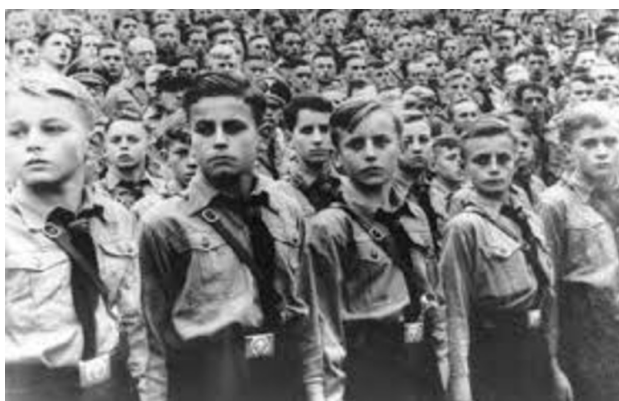
Fig. 5 - Hitlerjugend

It is for this reason that the Nazis fiercely attack Soviet Russia. They claim that the core of the Communist Party, beginning with Stalin himself, is composed of either Jews themselves or their relatives who have some connection to them and that, since people like these are up to no good, one of the great missions of the German people is to crush Soviet Russia. The speeches given by the leaders at the recent Nazi rally in Nuremberg, among others, were very extreme. They directly attacked the Soviet Union as their great enemy of the moment. They said as much as could be said in words, completely ignoring diplomatic niceties and attacking them viciously. From looking at the newspapers, you can get a good sense of their truly fierce determination. People are saying that if, in the past, the leaders of one country had done something like this it is inevitable that within twenty-four hours the other country would have declared war. In any event, the Nazis' determination is deadly serious!