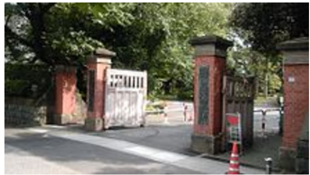
Fig. 9 – Entrance to Gakushūin