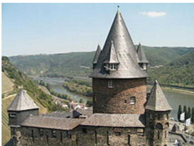
Fig. 6 - Stahleck Castle

Setting aside the question of Communism's ideology, the people at its core are intellectuals who have never been intimately connected with the land. Furthermore, their ideology is something that has been directly imported from abroad and has no roots in the history of that country. Taking their claims to be absolute, they butcher those who oppose them without hesitation. This is something that others and I can in no way approve. While it is true that Nazis and Fascists also insist on totalitarianism, in one sense it can be said that theirs is a form of resistance to Communist actions. Or it can also be understood as turning the Communists' methods to their own advantage.