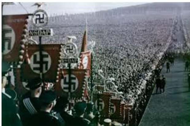
Fig. 4 - 1936 Nazi Rally in Nuremberg

On occasion, in England, too, I have encountered Jews. I recently met a young self-professed wealthy poet who had been persecuted and expelled from Germany. After listening to his story, I felt sorry for him because he suddenly found himself living in poverty in a foreign land. As regards individuals, this is truly a regrettable situation.