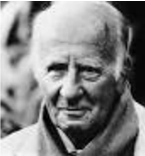
Fig. 2 - Graf Dürckheim