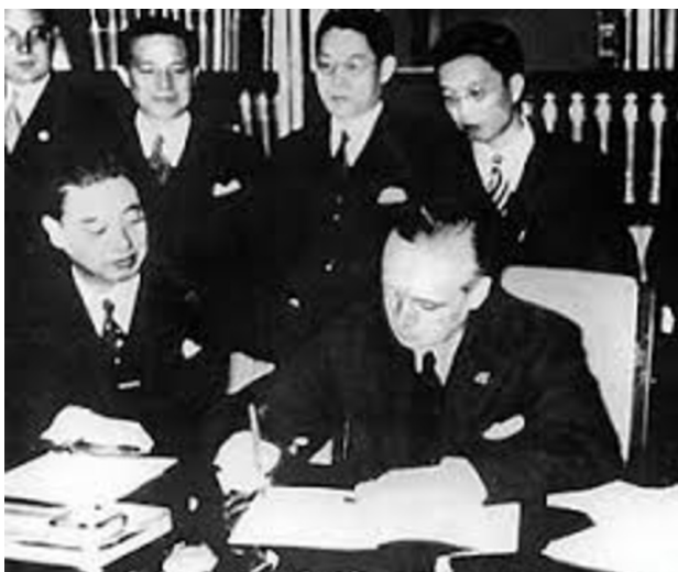
Fig. 7 - Signing of Anti-Comintern Pact

In short, the societal context within which a piece is written, coupled with the writer's personal background, are important and often neglected methods for determining the meaning of a text. In Suzuki's case, the question is not only the meaning he himself meant to convey, but also, what the editors of a major Buddhist newspaper would have allowed him to say in October 1936. As Sueki Fumihiko, one of Japan's leading historians of modern Japanese Buddhism, points out: "When we frankly accept Suzuki's words at face value, we must also consider how, in the midst of the situation as it was then, his words would have been understood." 6 In other words, what would Suzuki's readers have thought he meant?