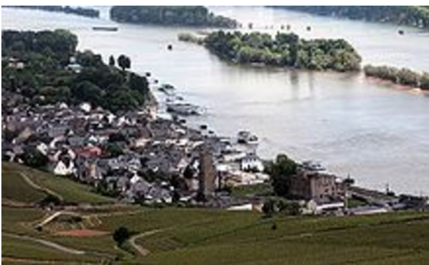
Fig. 3 - Rüdesheim am Rhein

Be that as it may, Suzuki went to England in 1936 where he delivered a set of lectures that he would publish as his famous Zen Buddhism and Its Influence on Japanese Culture in 1938 (republished in the postwar era as Zen and Japanese Culture ). Following the conclusion of his lecture tour in England, he went to Paris to conduct bibliographical research, and then on to visit some distant relatives living at the time in Rüdesheim am Rhein, a small village on the Rhine River west of Wiesbaden.