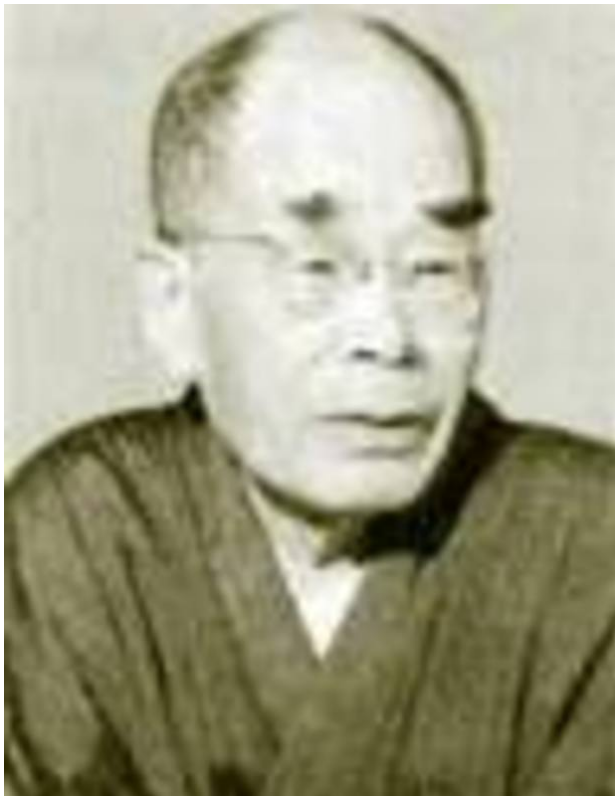
Fig. 1 - D.T. Suzuki

The always contentious, sometimes highly emotional, debate over D.T. Suzuki's relationship to Japanese fascism continues unabated. Among other things this is shown by reader reactions to a recent article in Japan Focus entitled " Zen as a Cult of Death in the Wartime Writings of D.T. Suzuki ". This debate can only intensify by the further assertion of a wartime relationship between D.T. Suzuki and the Nazis or, more precisely, a positive or sympathetic relationship between Suzuki and the Nazis. This article, in two parts, will explore that possibility though conclusive proof of such a relationship will not be included until the second part.