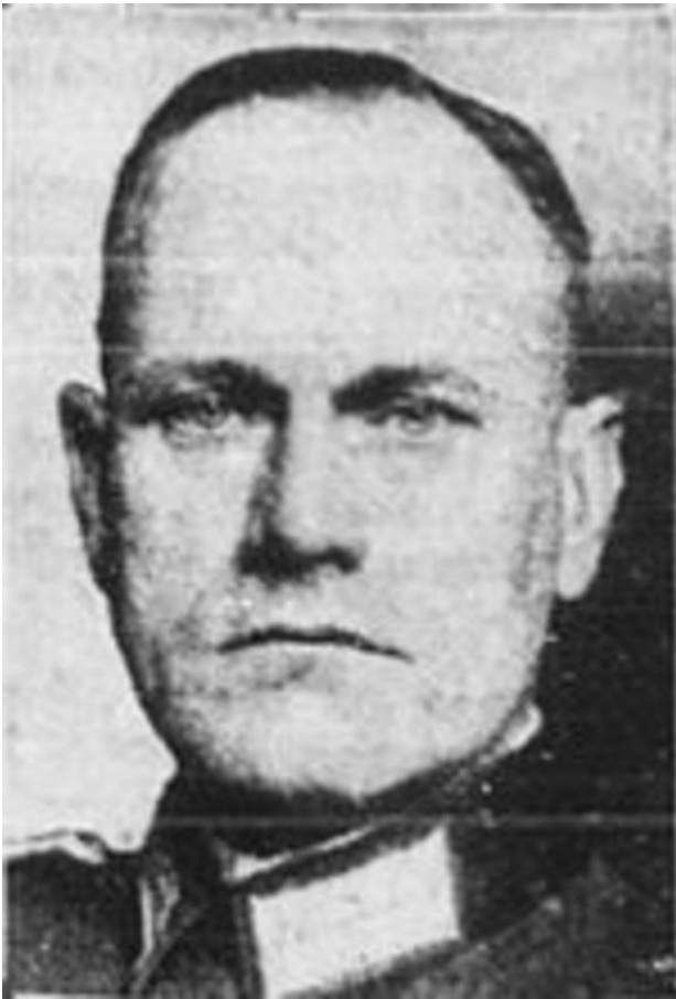
Fig. 10 - Ambassador Eugen Ott