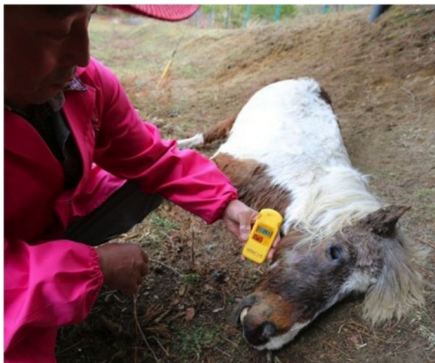
A dead horse at the Hosokawa ranch, 2013

Macaques, horses, mice and moss show similar effects. Wild macaques, which eat leaf buds from the surrounding forests, show high levels of Cs137 in their muscle tissues (10,000-25,000 bq/kg March 2011; 500-1,500 bq/kg June 2011;