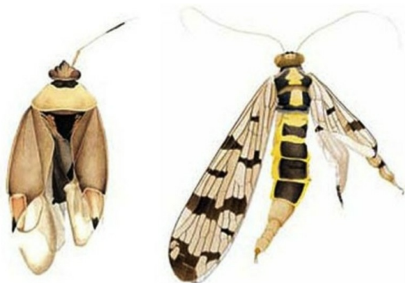
Left: Soft bug (Miridae) from Gösgen, Switzerland ; Right: Scorpion fly (Panorpis Communis) from Reuenthal, Switzerland