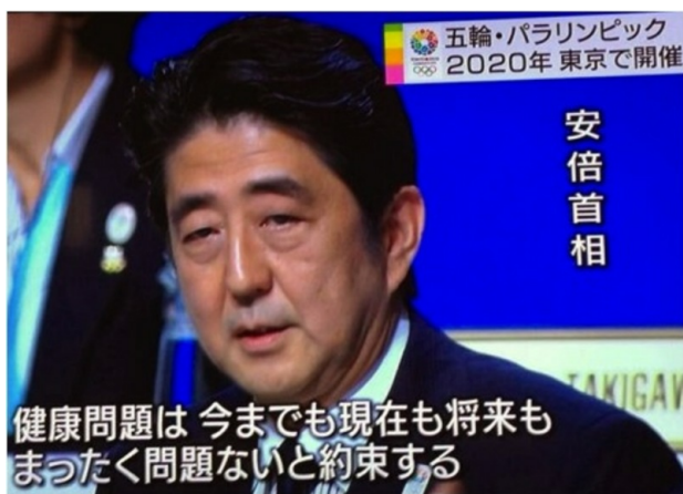
'I absolutely assure that health problems have not been a problem until now and will not be a problem in the future' – PM Abe Shinzo, IOC speech, 7 September 2013.

Prime Minister Abe's statement in Japan on 4 September 2013, followed by his performance as part of a final pitch to win the Olympics for Tokyo at the IOC meeting in Buenos Aires three days later, was intended to display decisive resolve toward the crisis. However, the discrepancy between representation and reality could not have been clearer. Abe assured the nation, and then the Olympic panel and an international audience that 'the [Fukushima] situation is under control. It has never done and will never do any damage to Tokyo'. He guaranteed, with a pledge of 47 billion yen (US $500 million) toward the plant, that his government would stop the radiation-contaminated water leaks from the Fukushima Nuclear Power Plant (NPP) so that 'there would be no problem at all in 2020'. In turn, Takeda Tsunekazu, the leader of the IOC bid claimed that life in Tokyo where people believed that the air and water quality was safe would continue as normal, as in most cities 'like Paris, London and New York', and that 'Fukushima' posed no risk to a 'great and safe Games'. 8 Contrary to their belief that contaminated water had been contained within the 0.3km port housing of the NPP, ionising radiation had been dispersed (and was continuing to spread) throughout the Kantō area, and further into the ocean.