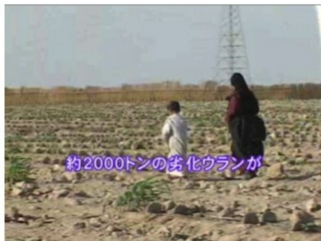
'Approximately 2000 tonnes of DU' - screenshot from Kamanaka Hitomi (dir.), 'Hibakusha: Sekai no owari ni' (Group Gendai Films, 2003)

The documentary showed reports from medical doctors and affected families from 1998 onward of spikes in infant and child leukaemias (acute myeloid leukaemias specific to nuclear radiation) and serious birth defects in Basra and Fallujah, and cases suspected in other locations. They traced the source to depleted uranium munitions (DU) used by US and UK forces in Operation Desert Storm during the first Iraq War (1990–1991). DU is a uranium product derived from enrichment processing of uranium ore, which concentrates the isotope uranium 235 for use in nuclear bombs or nuclear power reactors. The mixture of radioactive waste from this is comprised mostly of U238 (others are Thorium and Proactinium) which has a radioactive half-life of 4.5 billion years. In both the first and second (Operation Enduring Freedom, 2003) Iraq Wars, A-10 Warthog aircraft and armoured ground units (Abrams tanks and Bradley Fighting Vehicles) deployed rounds coated in solid uranium (4,500 grams), which dispersed 300 and 500 tonnes respectively of powdered DU into the local fields and water-ways. 35