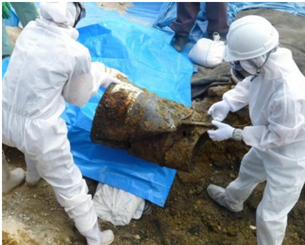
Workers unearth the barrels discovered beneath a soccer pitch in Okinawa, City.

The scientists' comments came in response to the July 31 release of independent tests undertaken at the request of Okinawa City by Ehime University - one of Japan's top institutes for dioxin testing. The study revealed that all 22 barrels found beneath the soccer pitch in Okinawa City contained traces of the herbicide, 2,4,5-trichlorophenoxyacetic acid (2,4,5-T), and 2,3,7,8-tetrachlorodibenzo-p-dioxin (TCDD), the most lethal form of dioxin. One barrel contained dioxin levels 840% the safe standard, while samples of water taken near the barrels revealed levels 280 times legal limits. Both 2,4,5-T and TCDD are two of the substances found in Agent Orange and other Vietnam War era defoliants. At least three of the barrels were labeled with markings from Dow Chemical Company - one of the primary manufacturers of Agent Orange.