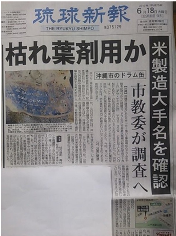
The discovery made headlines in Okinawa, including the Ryukyu Shimpo newspaper.