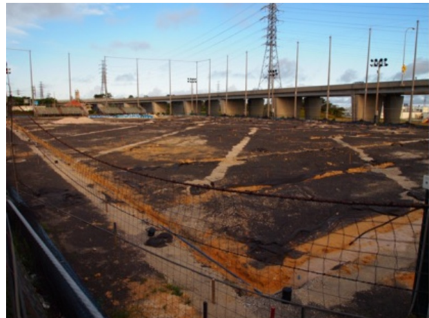
The soccer pitch in Okinawa City where the 22 barrels were unearthed.

(scientists) consider significant contamination."