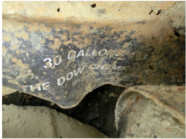
Some of the barrels were marked Dow Chemical.