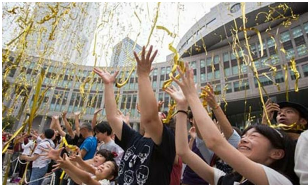
Celebrating the IOC decision in Tokyo

The September 7 decision by the International Olympic Committee (IOC) to award the 2020 games to Tokyo is potentially of monumental importance. That significance is not merely due to the fraught geopolitics of the so-called pivot to the Asia-Pacific or the collective angst of all those analysts waiting for Abenomics arrows. 1