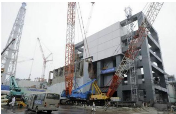
Tepco preparing to remove irradiated fuel

First the essential details . The roughly 1300 used fuel rod assemblies in the pool weigh in the neighbourhood of 300 kilograms and contain "radiation equivalent to 14,000 times the amount released in the atomic bomb attack on Hiroshima 68 years ago." Being spent fuel, they contain cesium 137 and Strontium 90, with half-lives of about 30 years. They also contain plutonium 239, with a half-life of 24,000 years. Sheldrick and Slodkowski rightly describe the latter as "one of the most toxic substances in the universe." The assemblies are to be removed from a concrete fuel pool 10 metres by 12 metres in area, and from within water 7 metres deep. The structure's base is 18 meters above ground level. Removing fuel assemblies is delicate enough at the best of times, but the pool itself may have been "damaged by the quake, the explosion or corrosion from salt water that was poured into the pool when fresh supplies ran out during the crisis."