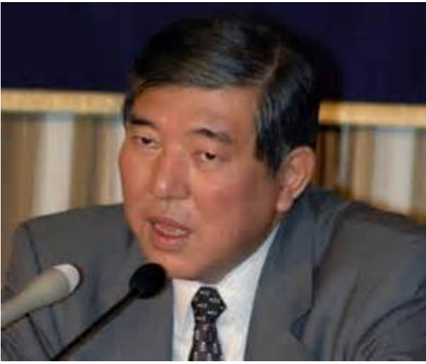
Ishiba Shigeru, LDP Secretary General, wants to keep the nuclear bomb option open

be made. (Tokyo Shimbun 9/22/2012) At a METI sponsored conference last autumn, an American speaker stressed that any such decision would have a very adverse impact on US relations. It would mean that Japan has no reactors to use the plutonium fuel and thus the US might have to retract permission to reprocess spent nuclear fuel sourced in the US. There are regional implications as well; South Korea lobbied vigorously this year for permission to enrich uranium and reprocess nuclear fuel in order to lower costs and better position its industry for reactor exports. Washington postponed deciding on Seoul's request.