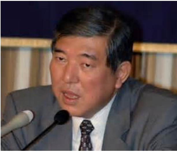
Ishiba Shigeru, LDP Secretary General, wants to keep the nuclear bomb option open

be made. (Tokyo Shimbun 9/22/2012) At a METI sponsored conference last autumn, an American speaker stressed that any such decision would have a very adverse impact on US relations. It would mean that Japan has no reactors to use the plutonium fuel and thus the US might have to retract permission to reprocess spent nuclear fuel sourced in the US. There are regional implications as well; South Korea lobbied vigorously this year for permission to enrich uranium and reprocess nuclear fuel in order to lower costs and better position its industry for reactor exports. Washington postponed deciding on Seoul's request.