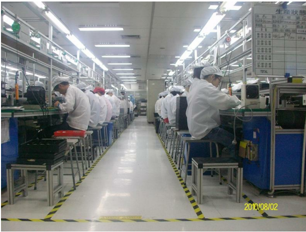
Foxconn assembly line