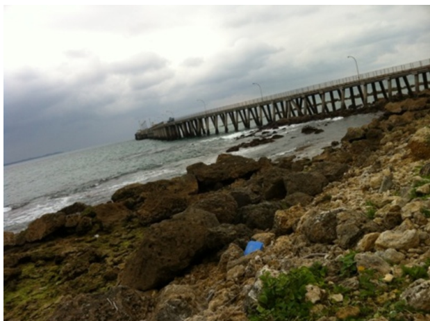
Windswept Ten Gan pier as it looks today – the staging post for the alleged Okinawa sea dump of chemical weapons.