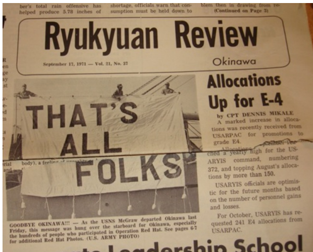
The banner hung on the stern of the final Operation Red Hat ship to leave Okinawa.

On the stern of the final ship to leave Ten Gan Pier, soldiers hung a large sign painted with the "Loony Tunes" catchphrase, "That's All Folks!" Following its departure, Okinawan officials scattered handfuls of salt to ritually purify the area.