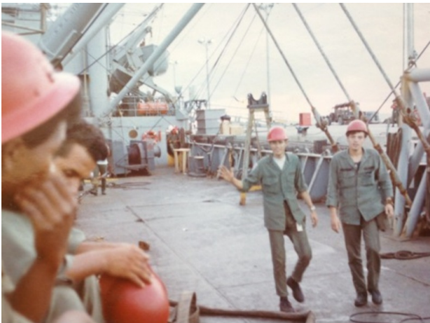
U.S. service members involved in the operation were all given tell-tale red hardhats.