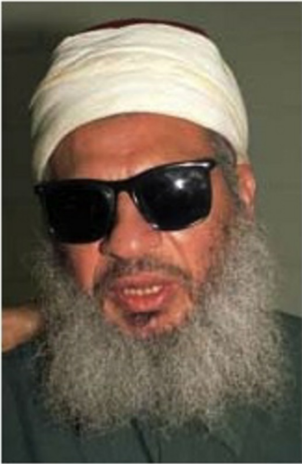
Sheik Omar Abdel Rahman

York City police and the Federal Bureau of Investigation has been set up to look into any possible international links to the slaying, the official said, but so far has not turned up anything.