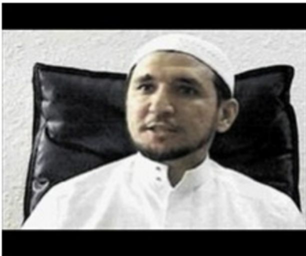
Mohammed Jamal Khalifa

It seems clear that the 1980s official USG block against antiterrorism actions that might embarrass the Saudis was still in force in America in 1995. We see this in the extraordinary federal protection extended to Mohamed Jamal Khalifa, Osama bin Laden's best friend and brother-in-law.