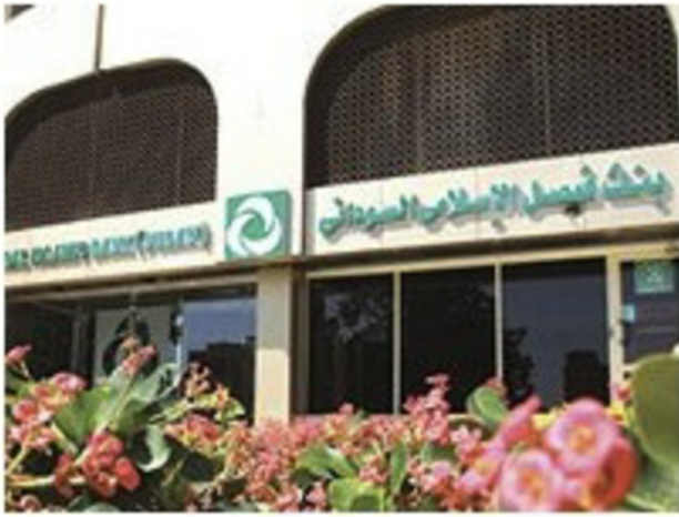
Faisal Islamic Bank of Sudan