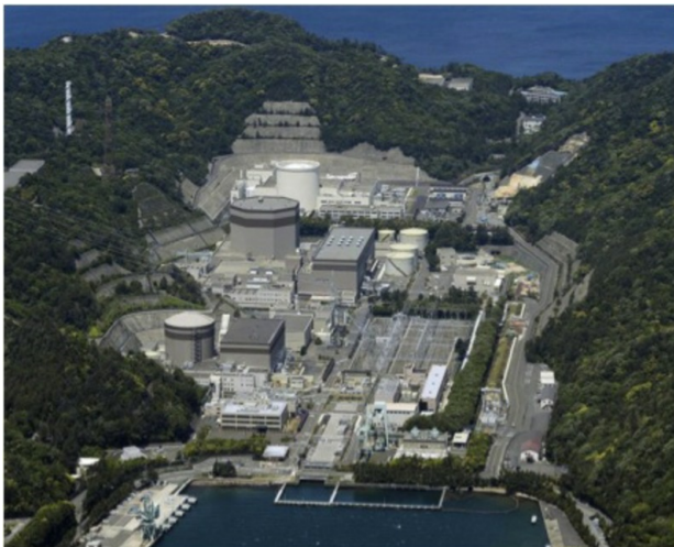
Fault under the Tsuruga reactor

There appear to be a number of problems with the above argument. First, Japan does not have 50 reactors ready and waiting to be restarted. Fully six of its nuclear plants (meaning sites with multiple reactors) are under investigation because there is concern that lax regulation saw them built on or too close to active seismic faults. The most recent example is the Tsuruga number 2 reactor in Fukui Prefecture. The previous and now defunct regulator (the Nuclear and Industrial Safety Agency of the METI) assented to its construction after a "shoddy" safety check, but on May 22 the new regulator (the "Nuclear Regulatory Agency," or NRA) accepted the advice of its five-member expert panel and ruled that the plant is built on an active seismic fault. 2