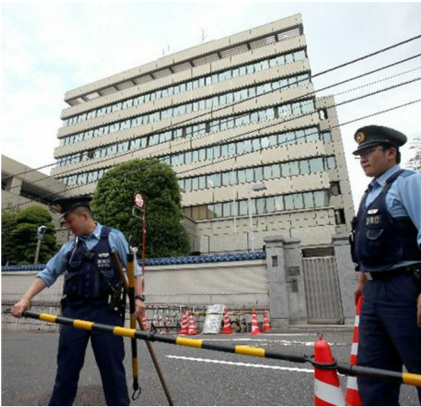
Picture 3: Chongryun Central Headquarters, Tokyo.