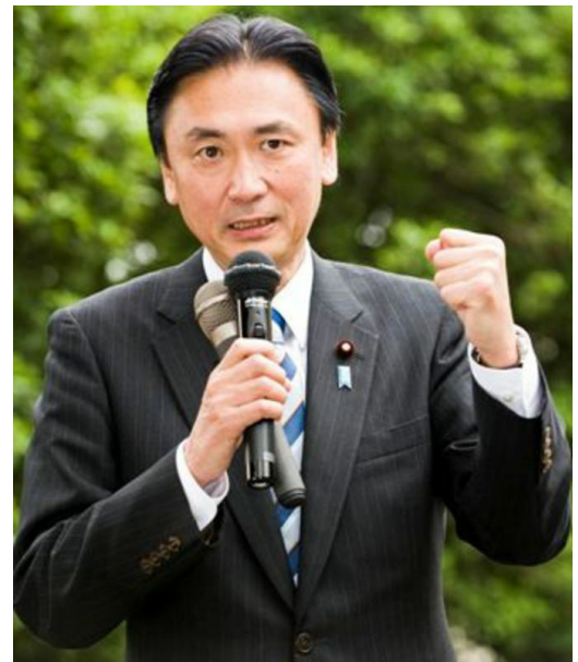
Picture 4: Furuya Keiji, Abe’s minister in charge of the abduction issue.

Emphasizing his willingness to renew the issue’s priority, on 29 January 2013 Abe launched a Bipartisan Council on the Abduction