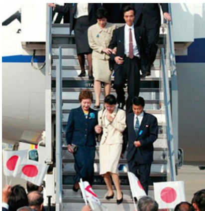
Picture 1: The Return of the "Pyongyang Five" (15 October 2002).

Hence, as is well known, Koizumi's overture of normalizing relations with Pyongyang was soon torpedoed by Japanese reaction to Kim Jong Il's revelation of the North's long suspected abduction of thirteen Japanese nationals, of whom eight have been declared dead by Pyongyang. 3 While Pyongyang hoped that an official apology would put an end to the abduction issue, the revelations immediately caused public outrage and anti-DPRK resentment in Japan. In Japanese eyes, North Korea failed to provide convincing evidence regarding the fate of the remaining eight abductees. Thus, the issue remained, and continues to remain, a logjam in the normalization of Japan-DPRK relations. Moreover, Tokyo's exclusive focus on the kidnappings has restrained Japan's diplomatic space for manoeuvring within the working groups of the Six Party Talks framework launched in August 2003 adding to the malfunctioning process of security multilateralism in Northeast Asia. 4