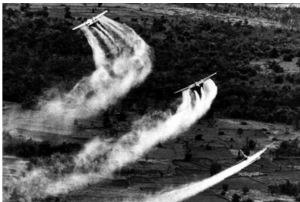
US Air Force planes spraying in densely forested area of Vietnam, 1966

The discovery of the Fort Detrick document comes soon after the release of another American military report implicating the Air Force in the storage of Agent Orange on Okinawa. “An Ecological Assessment of Johnston Atoll,” stated the U.S. Air Force transported 25,000 barrels of Agent Orange from Okinawa to