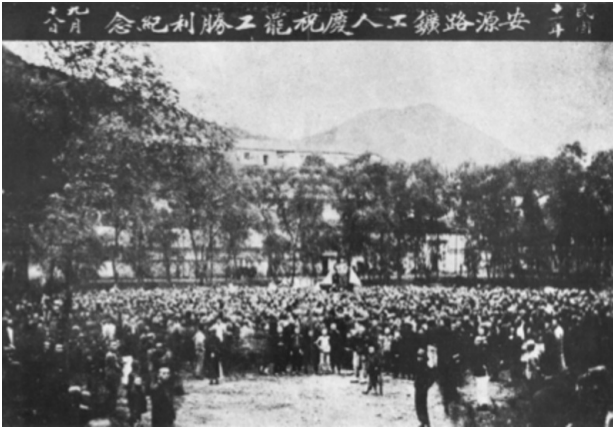
Figure 4. Celebrating the victory of the Anyuan Great Strike on September 18, 1922.

As soon as the strike settlement was signed in the chamber of commerce offices, Li Lisan convened a massive outdoor celebration in the open field in the center of town. To thunderous applause, Li ascended a makeshift stage. When he began to speak, a hush fell over the assembled multitude, who hung on his every word: "The victory of this strike was entirely due to our singleness of purpose. I hope everyone will forever maintain this spirit." 81 Li concluded his remarks with a rousing cheer—"Once beasts of burden, now we will be men!"—a mantra that the crowd echoed with a deafening roar. 82 A jubilant march through the streets of Anyuan to the accompaniment of firecrackers was followed by the promulgation of a triumphant work resumption manifesto, drafted by Li Lisan: "The strike has been victorious! . . . In the past, workers were 'beasts of burden' but now it's 'Long Live the Workers!' . . . We have received the support of the garrison commander and the martial law command post as well as negotiators from among the gentry, merchant, and educational circles, allowing our demands to be entirely satisfied. We thank them profoundly. . . . This strike was the first time that the workers of Anyuan lifted up their heads, exposing the dark side of Anyuan. From today forward we are closely united, of one mind, in the struggle for our own rights. We now wish to declare 'Long Live the Workers!' 'Long Live the Workers' Club!" 83