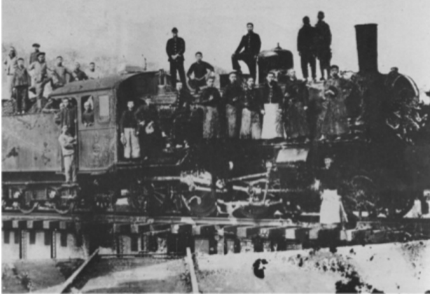
Figure 3. The Anyuan Workers' Club Preparatory Committee. Li Lisan stands in the central row from the engine head, fifth from the right. Zhu Shaolian is looking out the window of the engineer's booth.

Secret societies were not the only local institution whose practices the