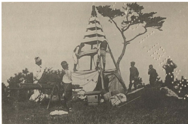
Figure 2. Surveyors constructing a signal pole atop a Korean peak.

In order to connect the geodetic triangulation of Japan proper with that of Korea, based upon the selection of principal points of triangulation in Tsushima island, Japan proper, the longitude and latitude of Zetsuyei (Chyolyong) island (near Fusan ) and Kyosai (Kō-jyō) island (near Masan ) in the extreme South of the Peninsula, and the distance between the two islands were surveyed (GGK 1911 43).