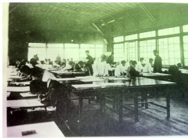
Figure 4. Employees of the Land Survey Bureau hard at work.

It goes without saying that the process described above was heavy on computation. Indeed, whatever the sophistication of the tools and techniques employed by the surveyors, their maps were only as good as the trigonometric computations made by the mapmaker, which were nothing if not voluminous. The principal challenge lay in translating data points into a map projection. As data poured into the processing centers (see figure 4), a cadre of employees worked to sort out this data in a timely and fluid fashion. Although Korean employees were more often tasked with filing the cadastral registers, they also contributed to the calculation component of the triangulation project, mostly as clerks. In the early stages of this operation, the draftsmen and professional cartographers were, with a few exceptions, Japanese.