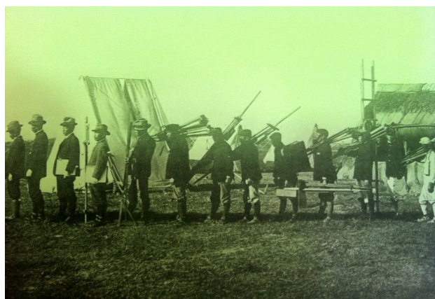
Figure 1. A surveying party gearing up for a day of fieldwork.

Shortly after annexation in August 1910, the government-general commenced the land survey. The work of the survey was handed over to the newly established Provisional Land Survey Bureau of the government-general, which assumed all responsibility for its operations. The official regulations of the land survey were set forth in Imperial Ordinance No. 361, codified in September 1910, just weeks after the Treaty of Annexation was inked. “A complete land survey of Korea,” stated a government-general report from 1910, “is of great importance in order to secure justice and equity in the levying of the land tax, and for accurately determining the cadastre of each region as well as protecting rights of ownership and thereby facilitating transactions of sale, purchase or other transfers. Otherwise, the productive power of land in the Peninsula can not be developed” (Government-General of Korea [hereafter GGK] 1911, 40). For the government-general, the land survey was thus the key to unleashing the productive power of Korean soil, and standardized maps—those that fashioned order out of perceived chaos (Scott 1999)—were the canvas upon which a new, rational, and productive Korea would be drawn.