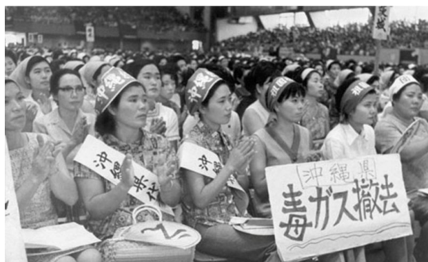
Poisoned ties: Okinawan women hold placard reading "Remove poison gas from Okinawa" at a Japan Mothers Association meeting in 1969 in Tokyo, just weeks after a poison gas accident at a U.S. installation on the island.

That disclosure began in 2000, when the Pentagon claimed that there had been 134 planned tests, of which 84 had been canceled. The experiments it admitted carrying out included the spraying of troops in Hawaii with E. coli, subjecting sailors to swarms of specially bred mosquitoes, and exposing troops in Alaska to VX gas. The Pentagon stated that no participants had been harmed in these