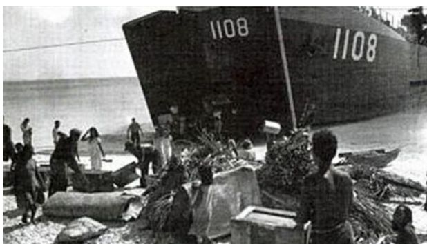
Residents of Bikini Atoll being forcefully evacuated so that it can be used for nuclear weapon testing (1946)

Finally, and surprisingly, the report barely mentions the American strategic military base that dominates the atoll of Kwajalein (the Ronald Reagan Ballistic Missile Defense Test Site). By ignoring this facility, the report leaves open the strategic and environmental impact of the operation of this military base on the Marshallese. 3 The psychological impact of an ongoing missile test site in a nation still traumatized by decades of contamination, secrecy, exclusion and neglect by nuclear weapons testing must not be ignored. A further implication not considered by the report is the Republic of the Marshall Islands joining with other regional nations in signing the Treaty of Rarotonga that formalizes a nuclear weapon free zone in the Pacific. 4