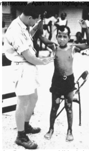
A Rongelapese child being examined by an AEC doctor after his exposure to radioactive fallout from the Bravo test (1954)

facilities, the report fails to foreground and recommend adopting a strategy for sustainable energy production and use from abundant, local renewable sources such as solar, wind, wave and potentially geothermal rather than the ongoing reliance upon imported fossil fuels. Given the current threat to the R.M.I. by climate change related sea level rises and extreme weather events, a continued, overreliance on imported fossil fuels seem doubly problematic.