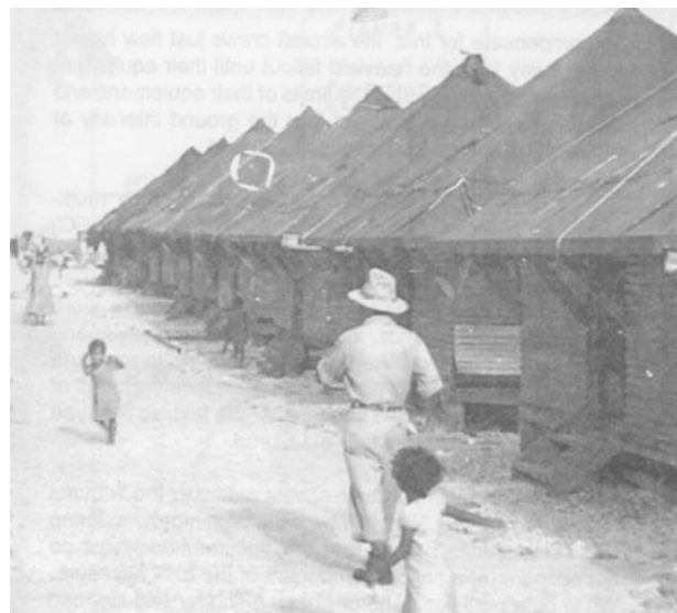
Bikinians in the housing provided for them as refugees (1948)

This report offers an important step forward in addressing the devastation to both community and environment that six decades of neglect have left in their wake. Our own, ongoing research on the social and cultural consequences of nuclear weapon testing around the world, conducted as part of the Japanese-government funded Global Hibakusha Project , largely supports the findings of the UN Rapporteur, while casting them in a global context.