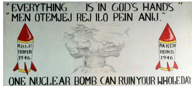
Artwork hanging in Bikini City Hall on Majuro Atoll

reliant on both the vagaries of international capital and the U.S. stock market. This long-term investment strategy offers little protection in times of economic uncertainty (e.g. post Global Financial Crisis), while essentially providing American tax payer funded subsidies to Wall Street without an enduring commitment to benefiting the Marshallese.