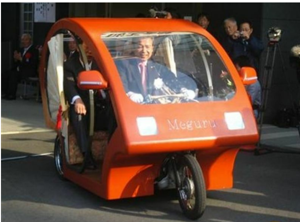
Three wheel electric car unveiled in Osaka, 2010

Since December 2011, Osaka City and Osaka prefecture have been amalgamating and reorganizing. Osaka City will be divided into eight or nine wards or individual municipalities, similar to Tokyo. The new Osaka Metropolitan Government will then deal with environmental issues while those policies related to residential living will be dealt with by individual ward governments. This means that much of what was done by Osaka City’s Environment Bureau will be taken over by the Osaka Metropolitan Government. Within this structure, Osaka is likely to pursue a wide-ranging strategy of applying scientific and technological innovations, combined with regulatory and other government strategies, designed to make the city and region a global leader in marrying technology and environmental protection and remediation. Mayor Hashimoto Toru’s outspoken opposition to the restarting of Japan’s nuclear power plants suggests continued support for the promotion and development of renewable sources of energy and sustainable low energy public infrastructure. Hashimoto, while building his new party to challenge the ruling Democratic Party of Japan has, however, been notably less supportive of the city’s environmental agenda than his predecessors.