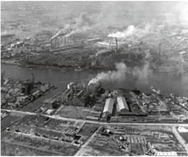
Industrial Osaka, 1955