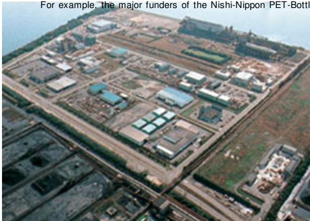
Kitakyushu's eco-town under construction

For example, the major funders of the Nishi-Nippon PET-Bottle Recycle Co. include Nippon Steel Corporation and Mitsui & Co., and the major funders of a company known as Recycle Tech include Shinryo and Ricoh Corporation. Indeed, it is not only funds that the parent companies are providing. In many cases the recycling factories are using production plants, technologies and know-how obtained from the parent. For example, the PET bottle plant is using know-how from Nippon Steel Corporation in its plant operating technology. 37