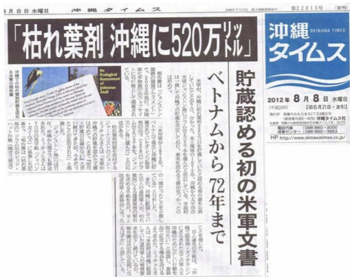
The discovery made the headlines of both the Okinawa Times

During the Vietnam War, 25,000 barrels of Agent Orange were stored on Okinawa, according to a recently uncovered U.S. army report. 1 The barrels, containing over 1.4 million gallons (5.2 million liters) of the toxic defoliant, had been brought to Okinawa from Vietnam before being taken to Johnston Island in the Pacific Ocean where the US military incinerated its stocks of Agent Orange in 1977.