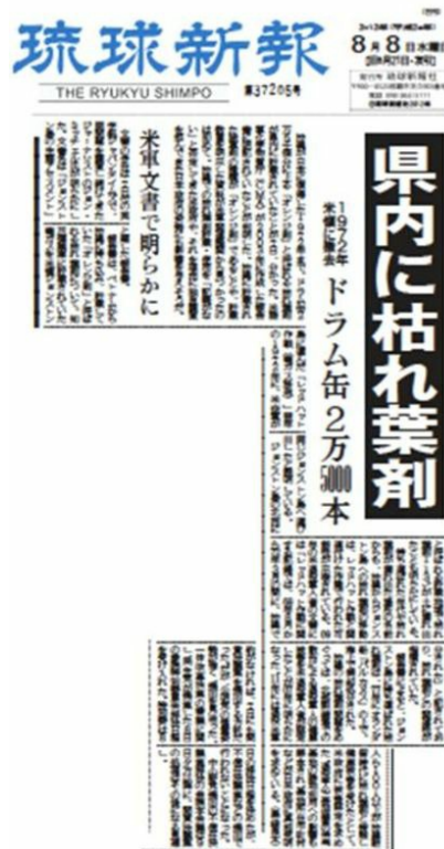
.. and the Ryukyu Shimpo

The army report is the first time the U.S. military has acknowledged the presence of these poisons on Okinawa - and it contradicts repeated denials from the Pentagon that Agent Orange was ever on the island. At the same time that the document was revealed, a series of photographs was also uncovered apparently showing many of the 25,000 barrels in storage on Okinawa's Camp Kinser near Naha City.