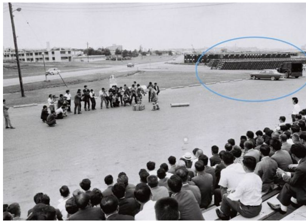
US military PR exercise for Operation Red Hat