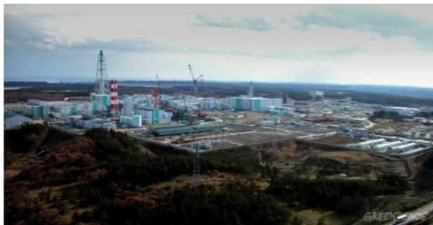
Aerial view of Rokkasho

According to a bureaucrat interviewed by the Mainichi, the aim of the amendment could be to guarantee the legitimacy of the nuclear waste storage, reprocessing, plutonium extraction and MOX-producing activities of the Rokkasho site located in Northern Japan. This reprocessing chain jointly built in 1993 with the French company AREVA, has never functioned and its storage capacity of used fuel is now almost saturated: 2834 tons of used fuel are now stored in the pools of the plant, fully 90% of its storage capacity.