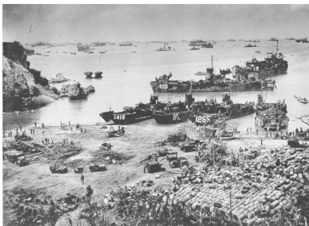
Americans landing in the Battle of Okinawa

Belatedly incorporated within the modern Japanese state, Okinawans were pressed to follow a path of self-negation, casting aside their distinctive language and culture, their “Okinawan-ness,” in order to become “Japanese.” Punished for speaking their own language, they were required to reorient their identity around service to the Japanese emperor and to participate in mainland myths and rituals. Less than seven decades after being launched on this process of identity change, in 1945 Okinawa was to be sacrificed in order to stave off attack on the “mainland” and preserve the “national polity”—meaning the emperor system. Japan’s war on Asia came “home” in the cataclysmic Battle of Okinawa, when more than 120,000 Okinawans, between one-quarter and one-third of the population, died. These months, March to June 1945, marked the islands as nothing before or since has. Beneath the surface of contemporary Okinawa, the memory of its horror remains fresh, and it constitutes a well-spring of thinking about the present and future.