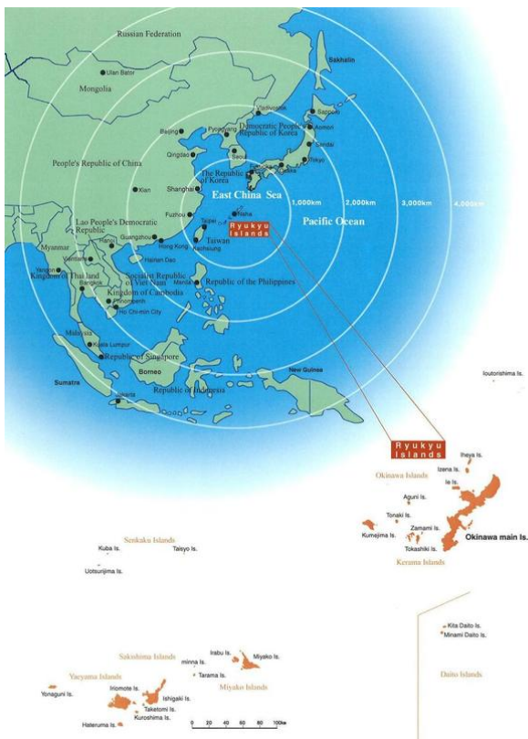
(Map by Executive Office of the Governor, Okinawa Prefecture)

The islands enjoy a mild subtropical climate and good rainfall with a rich marine reef environment. From the fifteenth century a flourishing autonomous state, the Ryukyuan Kingdom, trading along the China coast and as far south as Vietnam and Siam, formed part of the East Asian tribute world centering on Ming China.