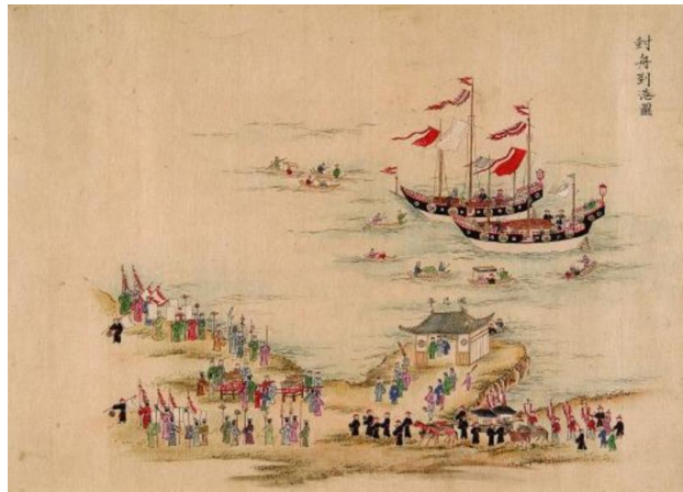
Images of Ryukyu Tributary relationship with China.

Though virtually obliterated from conventional historical memory, premodern Okinawa was a vigorous, independent economic, cultural, and political system, flourishing on the frontiers of the early modern Asia-Pacific. Its music and performing arts and its crafts, including lacquerware, dyed textiles, and pottery, were widely known and appreciated. However, the island kingdom that flourished in the fifteenth and sixteenth centuries was profoundly affected by major shifts in the global geopolitical balance starting in the late sixteenth century and continuing into the mid-twentieth century.