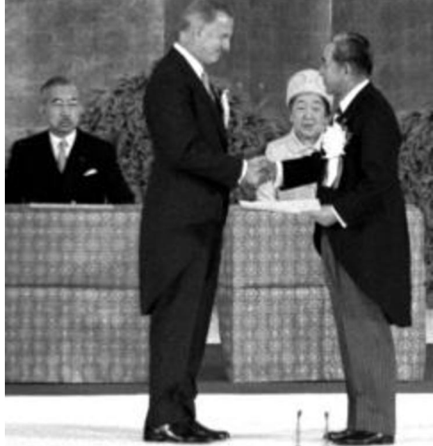
Emperor Hirohito and Empress Nagako in Tokyo look on as US Vice President Spiro Agnew presents Japanese Prime Minister Eisaku Sato with documents returning Okinawa to Japan.

The formal documents and instruments of power were therefore as deceptive and misleading as the Ryukyu expressions of tribute fealty to China and Japan