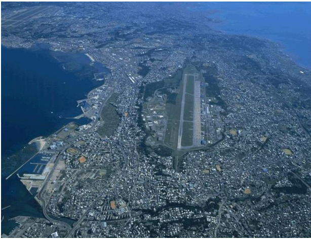
Ginowan City, with Futenma Air Station in the center of dense neighbourhoods