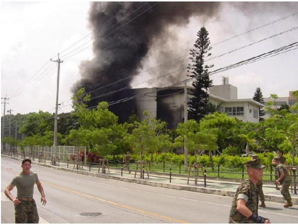
US Marine helicopter crashed into the campus of Okinawa International University, August 13, 2004.