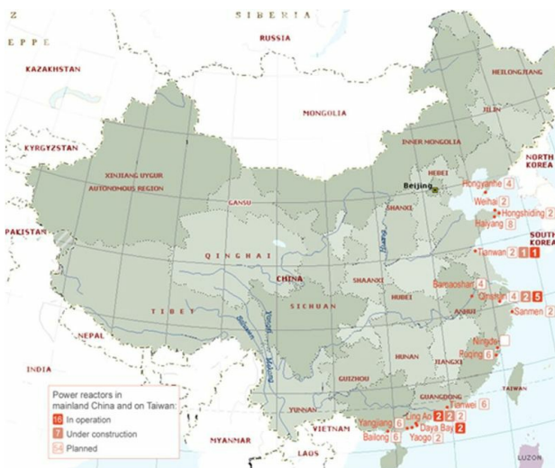
Chinese Nuclear Reactors. World Nuclear Association, 2012

China only started construction of its first commercial nuclear reactor in 1985, but its nuclear sector is developing fast, and it now hosts 40% of the world's reactors under construction. As of August 2012, China had 16 reactors in operation, which in 2011 provided just 1.85percent of the country's electricity. This compares to a historical maximum of 2.2 percent, since despite increases in the production from nuclear power, electricity demand is growing faster. Until Fukushima, China had an impressive recent history of construction starts. However, during 2011, though three reactors were completed, construction did not start on any further reactors. 3