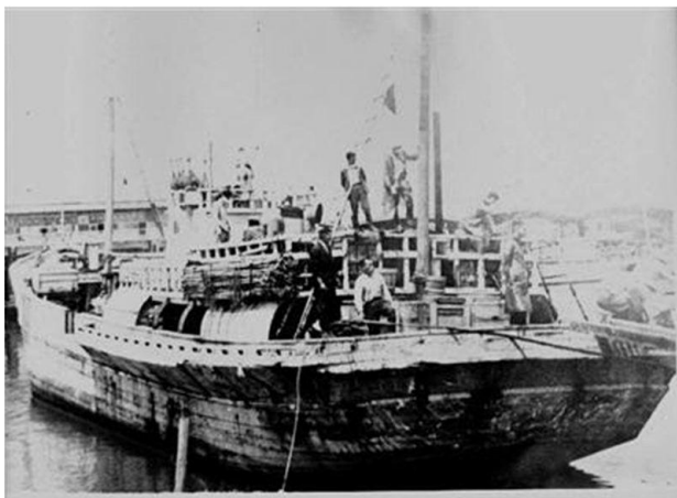
Lucky Dragon #5 returns to port

Why did Japan, the nation that experienced the destruction of the atomic bombings at Hiroshima and Nagasaki, followed by the Lucky Dragon #5 Incident of March 1954, in which Japanese tuna fishermen aboard the Daigo Fukuryūmaru (Lucky Dragon #5) were exposed to radiation fallout from the US hydrogen bomb test at Bikini Atoll, opt for nuclear power? The meltdown of reactors at the Fukushima Daiichi Nuclear Power Plant following the disastrous earthquake and tsunami of March 11, 2011 raised this question afresh for people around the world. Indeed, the House of Representatives of the Japanese Diet passed a budget for nuclear reactor research in early March 1954, shortly before the Lucky Dragon #5 returned to Japan and the tragedy of its crew was reported to the public.