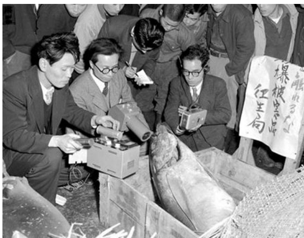
Scientists test tuna for radioactive contamination following the Lucky Dragon No. 5 incident

In the meantime, the tragedy of the Lucky Dragon #5 was reported on March 16th. The Yomiuri was the first to cover the incident in its morning edition on that day. 62 The tuna boat encountered the hydrogen bomb test on March 1st, and took days to return to its mother port in Shizuoka. Informants of Yomiuri reporters, who saw the fishermen, guessed that they suffered from radiation diseases, based on what those informants had read and learned from Yomiuri's earlier series. 63 Other major newspapers followed in their evening editions on the same day. The incident frightened many Japanese about the danger of nuclear bomb tests and the potential for nuclear war, as well as igniting fears that their daily life was in danger from radiation-contaminated food like tuna.