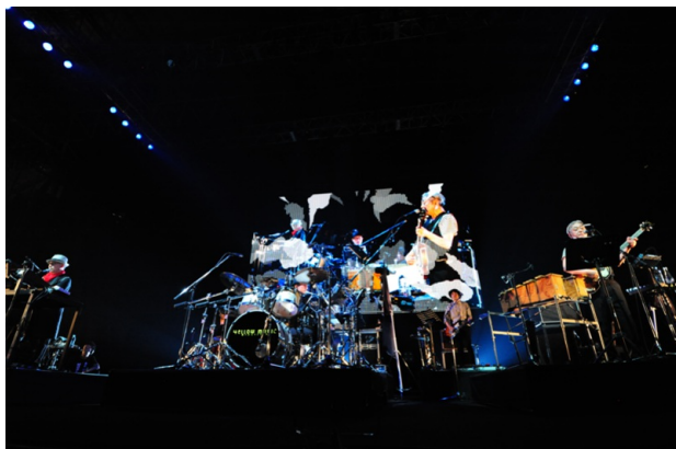
Yellow Magic Orchestra at No Nukes 2012

YMO also played their own version of "Radioactivity" and showed visuals with the words, "No Nukes / Yes Life/ More Trees."