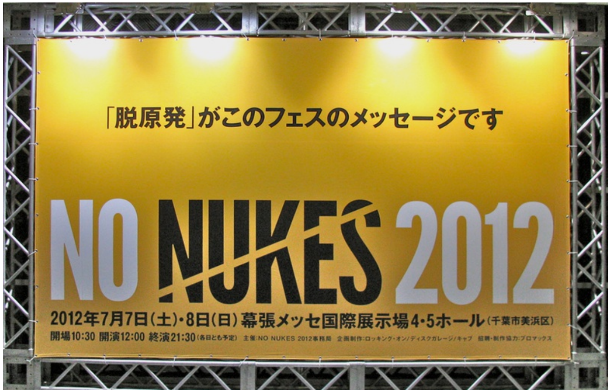
The Entrance to the Concert

On July 7–8, 2012, a two-day mass rock concert called No Nukes 2012 was held in the Makuhari Messe Convention Center in Chiba, near Tokyo. The organizer was Sakamoto Ryuichi , member of the groundbreaking Japanese technopop group Yellow Magic Orchestra (YMO) and Academy Award-winning composer. Profits from the concert were donated to Sayonara Genpatsu 1000 Man Nin Akushon (Citizens' Committee for the 10 Million People's Petition to say Goodbye to Nuclear Power Plants), an antinuclear group which Sakamoto has been backing, along with Nobel Prize-winning author Oe Kenzaburo and others. The concert featured performances by 18 groups, including pioneering electronic groups Kraftwerk and YMO as well as rock bands Asian Kung-Fu Generation, Acidman, and others.