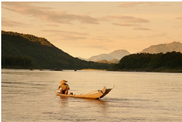
Fishing on the Mekong River, Luang Prabang, Lao PDR

The 'traditional' sector is generally subsistence based, and reliant on natural resources as the basis of livelihood. It is largely rural, involving small-scale fishing and agriculture, as well as the gathering of other natural supplies. These livelihood activities are dubbed 'traditional' as they have changed little over the centuries. The vast majority of the LMB's sixty million inhabitants are involved in this sector, where fishing and agriculture continue to form the foundation of economic and food security (Sarkkula et al., 2009). Agriculture is the most common occupation and primary source of income throughout the LMB. Small-scale fishing is also near-universally practiced throughout the basin, providing a crucial source of nutrition, as well as supplementary income.