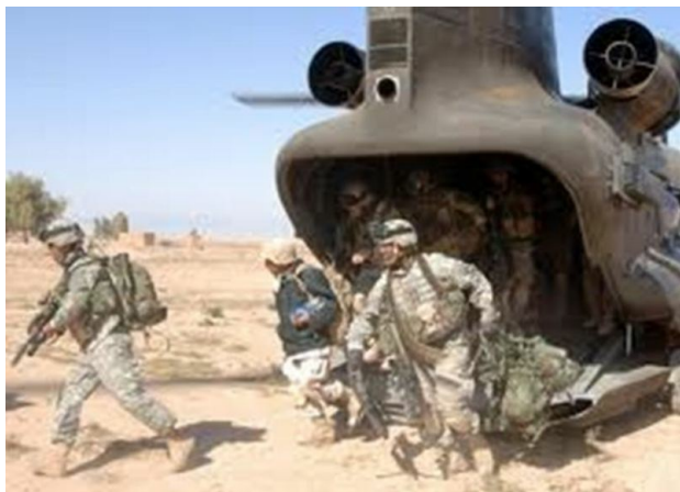
U.S. invasion of Iraq

The U.S. dollar, weakening as it is, still depends largely on the OPEC policy of demanding U.S. dollars for payment of OPEC oil. Just how strongly America will enforce this OPEC policy can be seen by the fate of those countries that have chosen to challenge it. "Saddam Hussein in 2000 insisted Iraq's oil be sold for euros, a political move, but one that improved Iraq's recent earnings thanks to the rise in the value of the euro against the dollar." 9 Three years later, in March 2003, America invaded Iraq. Two months after that, on May 22, 2003, Bush by executive order decreed that Iraqi oil sales would be returned from euros to dollars. 10