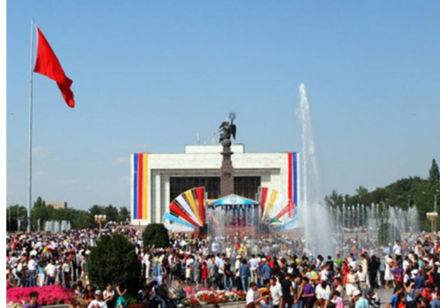
Bishkek Square during the “tulip revolution”

To some extent the Obama regime has retreated from the hegemonic Pentagon rhetoric of (in its words) “full spectrum dominance.” 27 But it is not surprising