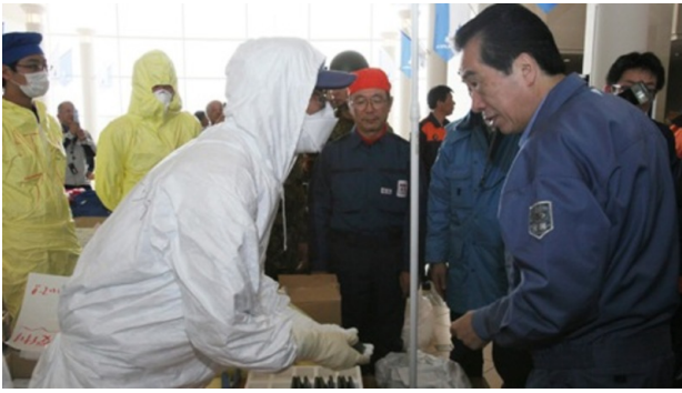
Prime Minister Kan Naoto speaks to an employee of TEPCO at Naraha town, Fukushima Prefecture, Saturday, April 2, 2011.

disaster responders and disaster experts and heard many stories of the successes and failures of the earthquake/tsunami response. However, in the course of 20 lectures and 28 interviews, I cannot recall anyone telling me that the Japanese Government had asked for their opinions or inputs as to how to strengthen the response for future disasters.