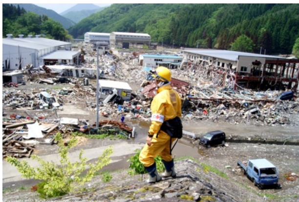
Volunteer response teams enter a small town in Iwate Prefecture

Sixth, shelter management in the disaster-stricken areas was weak and inconsistent, and in some cases appeared to be nearly nonexistent. Many shelters were described as either being “self-managed” or having “no management.” Local residents did their best to manage local shelters in the absence of any government presence or any guidance on shelter management. The result was a very uneven level of management where some shelters very well run and others were not.