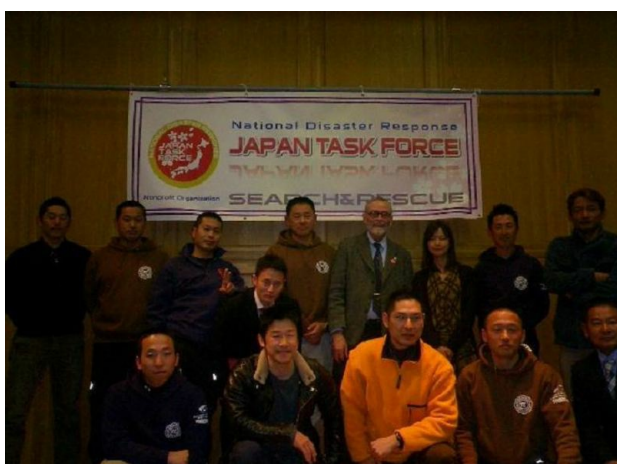
The author (back row, fifth from left) with members of the Japan Task Force for Search and Rescue, Kobe, Japan, February, 2012.

Concerning the second question, FEMA's system didn't "fail" during Hurricane Katrina...it didn't even exist any more! When George W. Bush took office in 2001, the dissolution of FEMA began almost immediately. Experienced disaster managers at FEMA were replaced by political hangers-on. Training was cut back. Emergency teams were eliminated. FEMA staff positions were left empty, their funding handed over either to Homeland Security or to private contractors. FEMA itself ceased to exist as an independent agency and was folded into the Department of Homeland Security, where the first three priorities were terrorism, terrorism, and terrorism. For awhile, even the name "FEMA" was abolished and the agency was called the "Emergency Preparedness and Response Directorate" of Homeland Security.