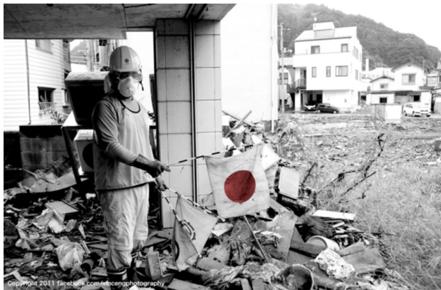
A volunteer holds up a flag found in the rubble of Kamaishi City.

Fourth, the government did not fully utilize the potential of volunteers, donations, and Non-Profit Organizations (NPOs). The government did not appear to have a plan for incorporating NPOs or donations management into the disaster response. As a result, NPOs received little or no advice from the government as to what was needed or where, and were left to their own devices (and personal connections) to send aid into the disaster area. Donations of critical items such as food were turned away by the government at the very time when many survivors were desperately in need. On the other hand, unneeded donations poured into some areas, resulting in oversupplies of food and medicine in some locales while others faced severe shortages.