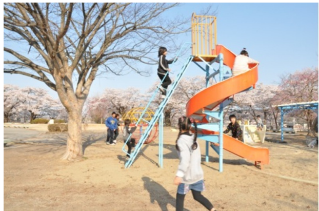
Children at play at Yonomori Park, April 21, 2012 at the peak of cherry blossom viewing

Growing concern about the health risks for children aside, residents of the city appear to be leading ordinary lives. At Yonomori Park, the most popular site for “Hanami” viewing in the city, about a dozen children played in the sand under the beautiful cherry blossom on April 21th – admittedly a much smaller number than usual.