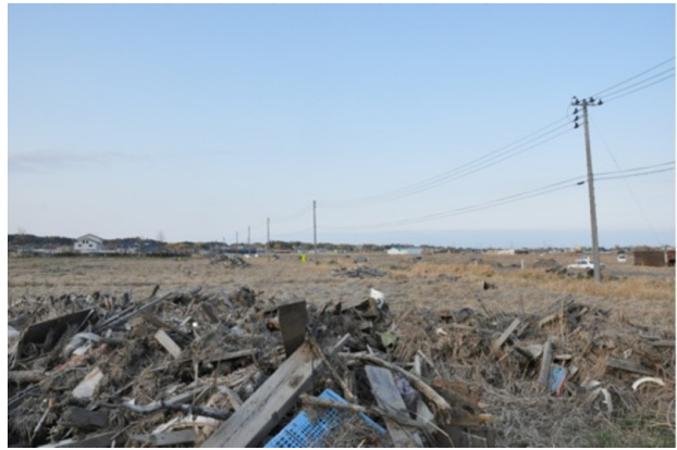
Odaka under mountains of debris one year after the earthquake

from houses that had been partially swallowed up by the water.