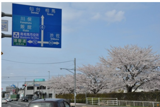
Cherry blossoms in Minami-soma

Even if it were safe, Odaka has other problems: "There is no reconstruction of public facilities and infrastructure, and I wonder how we can make a living there." There is also growing anxiety over the compensation process among evacuees inside the newly liberated zone. Does this mean that compensation is going to be halted, as many fear?