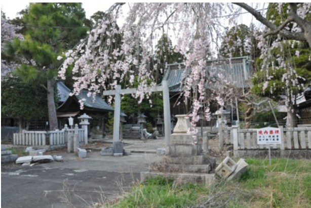
Odaka-Shrine--deformed by the earthquake

April is a symbolic month in Japan because thousands of students enter new schools. Some public schools in the city that were closed amidst fears of high radiation are now able to reopen, based on the results of the local governmental reports on decontamination.