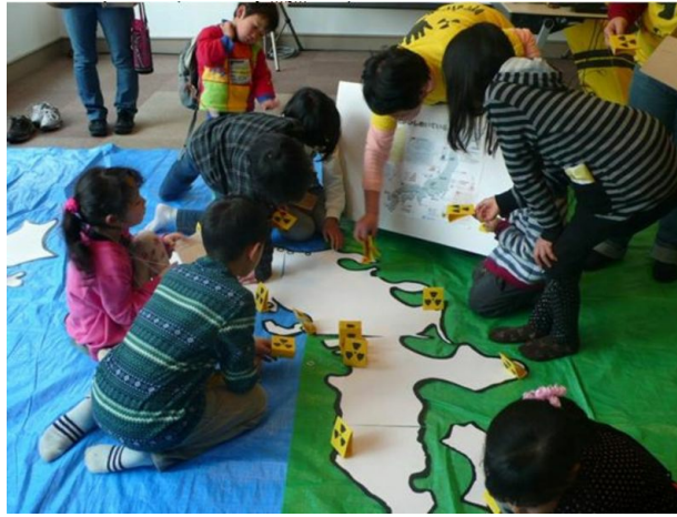
Children during Conference for a Nuclear Free World, Yokohama, Jan.14-15, 2011.

storage pools of used fuel rods from meltdown. This was even more vital than saving the reactors, since if the fuel rods in the pools melt, they would produce radioactivity levels that could not be measured in hundreds of millisieverts but would need to be measured in hundreds or thousands of sieverts! In that case, TEPCO would have been unable to intervene by sending in workers. It would lose complete control of the site. The result might then be something like a Godzilla movie, an apocalyptic scenario. As a recent "independent" report suggests, at the very least, Tokyo should have been evacuated. 7 I doubt the authors' independence because they focus their criticism on Prime Minister Kan Naoto, avoiding discussion of the responsibility of the nuclear industry