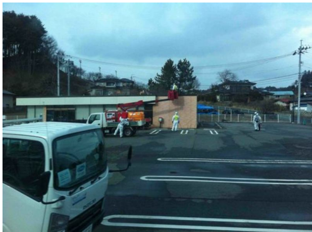
Decontamination work ( josen ) in Iidatemura, 13 January, 2012.

The major problem is that the government is not investing enough in monitoring devices for food. Of course, these devices are more expensive than simple dosimeters, and there is also the high cost of the labor required to perform systematic tests. However, this would be more effective than the "decontamination" operations being proposed and conducted in Fukushima. For example, the nuclear lobby has urged the Government to provide grants for cleaning with pressurized water guns!