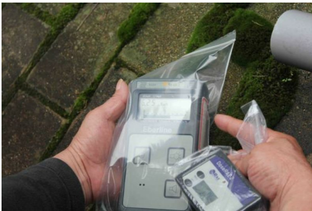
A hot spot in the suburbs of Fukushima city, August 2011: the dosimeter records 6.25 microsieverts per hour (54.75 mSv a year).

In fact, the debate has been greatly distorted since World War II, starting with the American "Atoms for Peace" program of 1953 that promoted nuclear power globally and in Japan sought to sweeten the pill of the atomic bombings of Hiroshima and Nagasaki by clearly distinguishing the ravages of nuclear weapons from the benefits of nuclear power. 1 The result is that, for sixty years, nuclear industry-subsidized pseudo-scientific research has greatly simplified the health consequences of exposure to ionizing radiation. 2