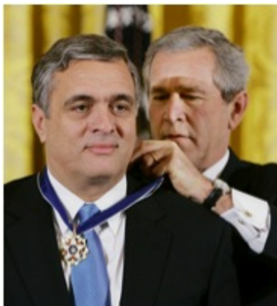
President Bush awarding National Medal of Honor to George Tenet, Dec. 14, 2000

Farmer's first alternative, of "unprecedented administrative incompetence," is in effect the explanation offered by the 9/11 Commission Report, to deal with a) striking anomalies both on 9/11 itself, and b) the preceding twenty months during which important information was withheld from the FBI by key personnel in the CIA's Bin Laden Unit (the so-called Alec Station). But thanks to the