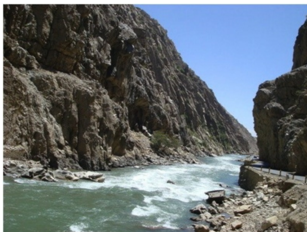
Panjshir valley, area of Northern Alliance dominance