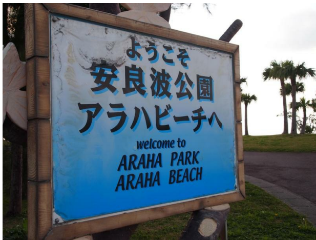
A sign welcomes visitors to Araha Beach - site of the alleged burial of hundreds of barrels of Agent Orange

soldier explained that he had served on the docks with the 44th Transportation Company between 1965 and 1966. According to his statement, "We provided logistical support for the Republic of Vietnam war effort. Our mission was to unload large transport ships. Such items as 55-gallon drums of herbicides, oils, solvents and other materials. We handled the drums with (sic) loading and unloading, and often these drums leaked which contaminated our hands and clothing."