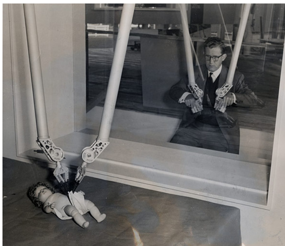
"Magic Hands" Demonstration in Berlin. September 26 1954.