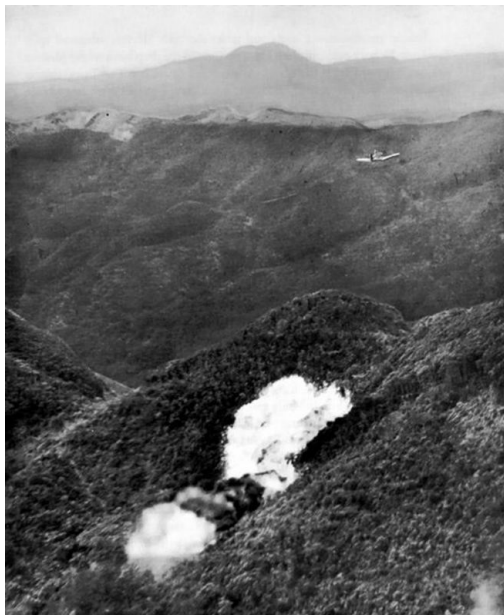
Firebombing in Northern Okinawa

Fighting in the Battle of Okinawa (late March to late June, 1945) was sporadic around Henoko, and in the northeastern part of the main island generally. Still, Henoko residents died in artillery fire and bombing raids, which forced many to abandon their homes for refuge in nearby hills and forests.