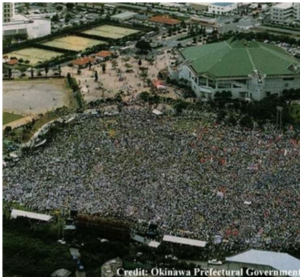
October 25, 1995 demonstration

marginalization of poorer northern districts by the wealthier and more politically powerful southern and central districts. Nago Mayor Higa Tetsuya condemned Governor Ôta's decision at the time, saying "the northern region is not a trash bin of military bases." He evoked Okinawa's past history of domination and exploitation of northern areas by south-central Okinawa, a pattern that goes back to the days of the Ryukyu Kingdom when resources of firewood and water were extracted for use in other regions. 35