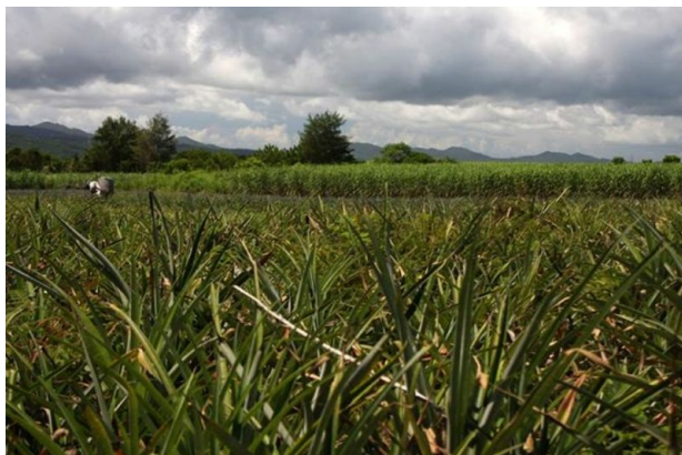
Pineapple farm in Northern Okinawa. Tea and sugar are also widely grown.

The Henoko administration hurriedly created an entertainment quarter by clearing communal fields and forests. Some leaders curried favor with [U.S.] authorities and illegally appropriated their bulldozers and trucks for development of the entertainment quarter, which ultimately got them arrested. People from all over Okinawa flooded Henoko, where men became construction workers, and women worked for restaurants and bars. 16