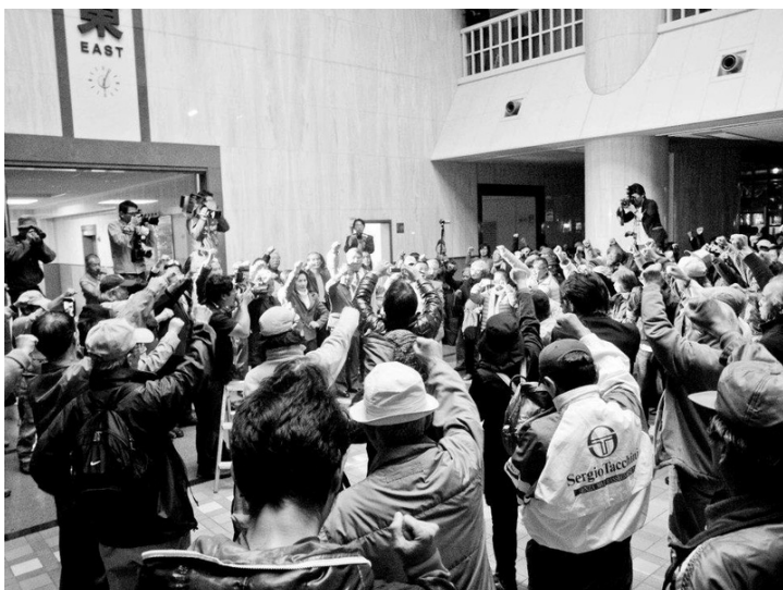
The Prefectural Office, 27 December 2011.

Because my health has not been good, I participated just on the 27 th (when the delivery by mail was anticipated). Setting off from Henoko at 7 a.m., by the time we of linagukai together with comrades from the Henoko Tent Village arrived at the prefectural office after 8 a.m. the watch had already begun over the two entrances for delivery of postal goods and parcels (with civic groups and labour groups dividing the labour) and the underground car park entrance. Pep talks given on the microphone by National Diet members Yamauchi Tokushin and Teruya Kantoku (and later Itokazu Keiko) lifted our spirits.