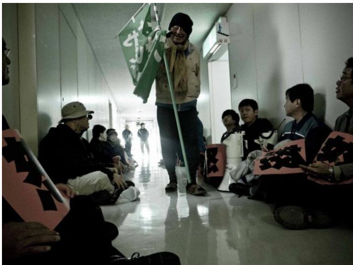
Protesters at Prefectural Office, Naha, 27 December 2011.

and on the relevant offices inside, the Okinawa Defence Bureau announced that “We have had to give up on delivering [the document] directly to the prefectural office because of the blocking action, and so we have sent it by post.” The civic group, while recognizing that they had been able to block submission on that day, protested that “delivery by mail is trickery.”