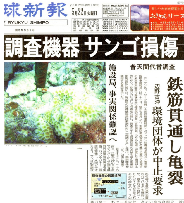
Fig.3, Ryukyu Shimpo , May 22, 2007 Survey Instruments Damaged Coral Pre-EIA Study of Futenma Replacement Facility Project

This deduction is quite illogical. As shown in Fig.2, Okinawa dugong used to be observed very frequently along the east coast of Okinawa Island including offshore Henoko. Therefore, DEIS should clarify why they were not observed in the Sea of Henoko during ODB study conducted in the period of August 2007 – April 2009. DEIS, however, made no analysis of this topic. One possible reason they did not appear is the effect of the massive study conducted by ODB at the offshore Henoko area prior to the EIA process that started in August 2007 with the submission of the Scoping Document (SD). The study cost more than 2 billion yen (more than 25 million dollars). The study of coral and dugong as well as geotechnical investigations of the area began in 2004 with numerous borings. Environmentally conscious citizens carried out nonviolent protests against this survey using canoes. To force their way through the protests, the ODB even deployed even the Maritime Self-Defense Force mine-sweeper Bungo in the middle of the night, using their frogmen to install equipment to study coral and dugong. Because these crude installations damaged the offshore coral at Henoko this incident made the front page of the local newspaper Ryukyu Shimpo on May 22, 2007 (See Fig.3).