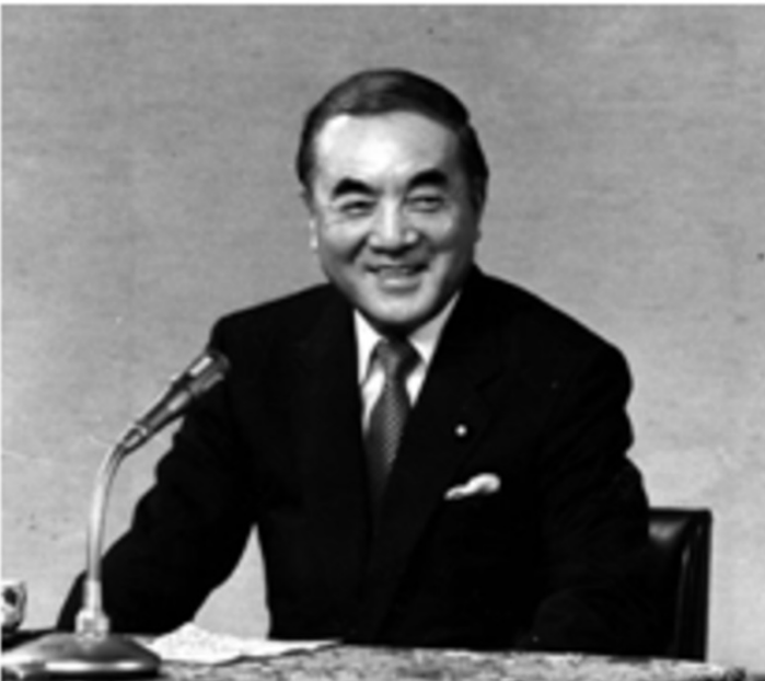
Nakasone Yasuhiro (1918 - )

Next, let’s look at the relationship between the nuclear industry and government bureaus. For some five decades, virtually without interruption, the director of the agency in charge of nuclear power, the Agency for Natural Resources and Energy within METI (formerly the Ministry of International Trade and Industry), has been hired as a vice president of TEPCO when he retired from government. This practice of amakudari (providing lucrative post-retirement jobs to bureaucrats) is widespread. In addition to the 146 companies that are associated with TEPCO’s operations, there are 25 semi- and extra-governmental agencies that deal with nuclear power, including the Nuclear and Industrial Safety Agency and the Japan Nuclear Energy Safety Organization. Each year, dozens of retiring administrative vice-ministers and other high-ranking bureaucrats from METI and MEXT are rewarded with jobs in these companies and agencies. These bureaucrats are promised a comfortable passage through revolving doors: they receive hefty bonuses when they retire from government