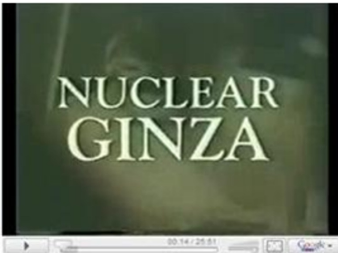
Nuclear Ginza (Channel 4, 1995. LINK to view video)

service, then are immediately re-employed by a related entity, where they receive high salaries and further bonuses when they retire again after a few years, often moving on to yet another sinecure.