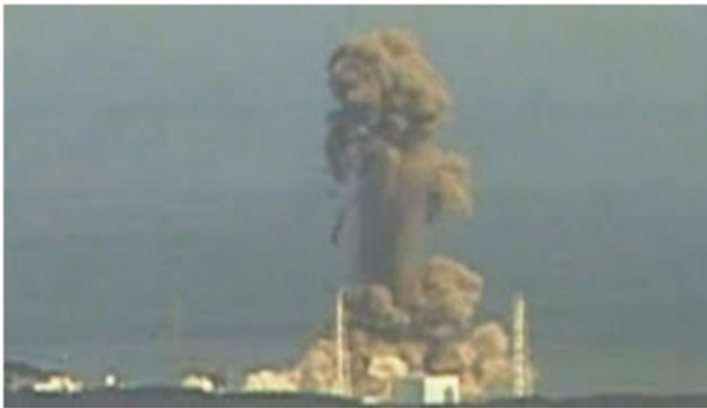
Explosion at No.3 Reactor of Fukushima Daiichi, March 14, 2011

At midnight on April 22, 2011, the Japanese government designated the zone within a 20-kilometer radius of the Fukushima nuclear power plant a controlled area under the Basic Law for Disaster Countermeasures. As a result, all entry into the zone was prohibited without special government permission. Some 78,000 people were separated from their homes, without knowing when they might return.