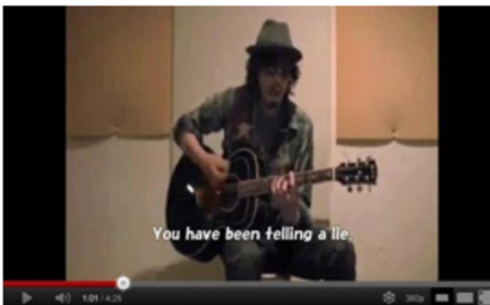
Saito Kazuyoshi's song, with English subtitles ( LINK to view video)