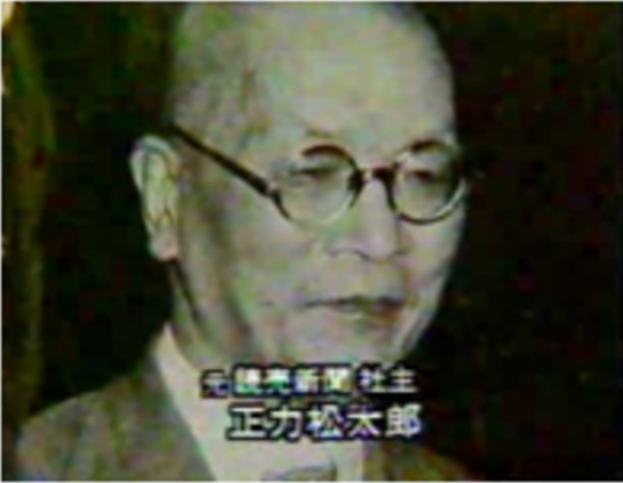
Shoriki Matsutaro (1885 – 1969)

in nuclear power when he was in the Japanese Navy during the war, and as soon as he became a politician after the war, he delivered a petition on nuclear energy research to the Supreme Commander of the Allied Powers, Gen. Douglas MacArthur. When Nakasone submitted a budget for nuclear energy development to the Diet in 1954, nuclear energy was launched in Japan.