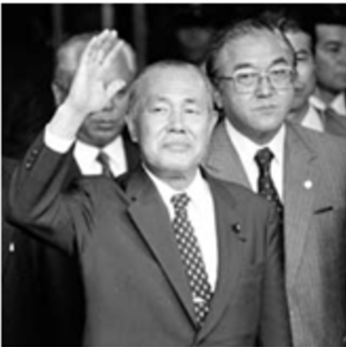
Tanaka Kakuei (1918-1993)