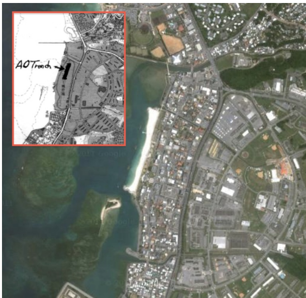
The area identified by the former US soldier is now a mixed residential/business neighborhood in Chatan Town, Okinawa.

After he had helped remove the damaged barrels, the veteran claims that he then witnessed the Army bury them in a large pit. "They dug a long trench. It must have been over 150 foot long. They had pairs of cranes and they lifted up the containers. Then they shook out all of the barrels into the trench. After that, they covered them over with earth." 3