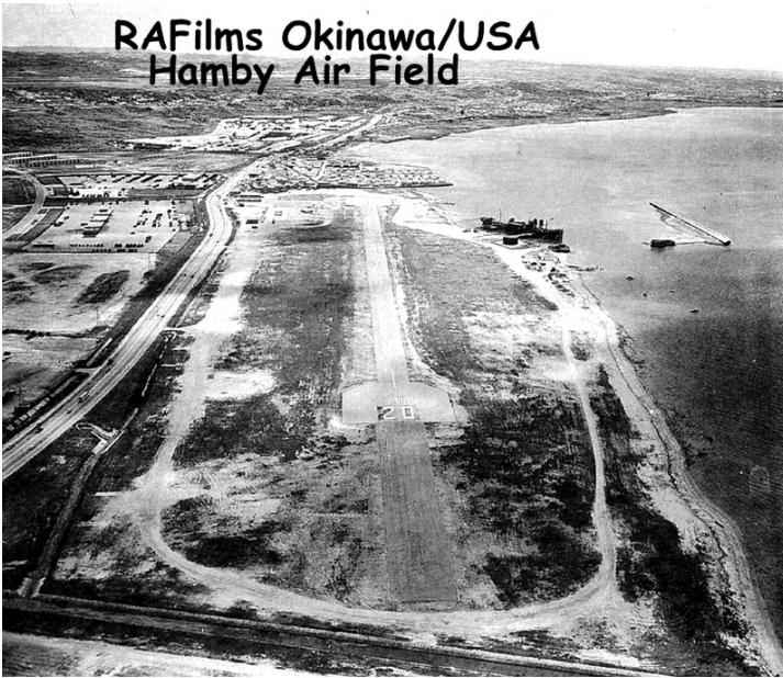
Hamby Air Field at the time the barrels were allegedly buried