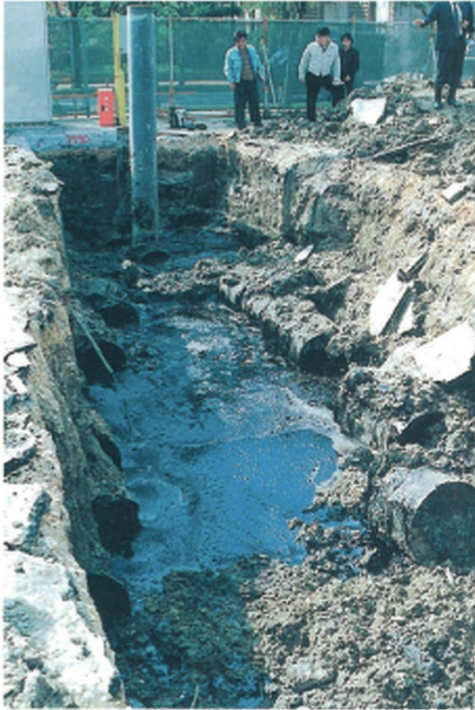
In 2002, over 200 barrels of unidentified US military waste were discovered in Chatan near the alleged Agent Orange burial site.

not be so sophisticated. "Simply use a backhoe and dig down to the depth of the barrels and take samples. This would be more disruptive to the actual profiles in the soil, but could provide a clear "yes" or "no" answer regarding contamination."