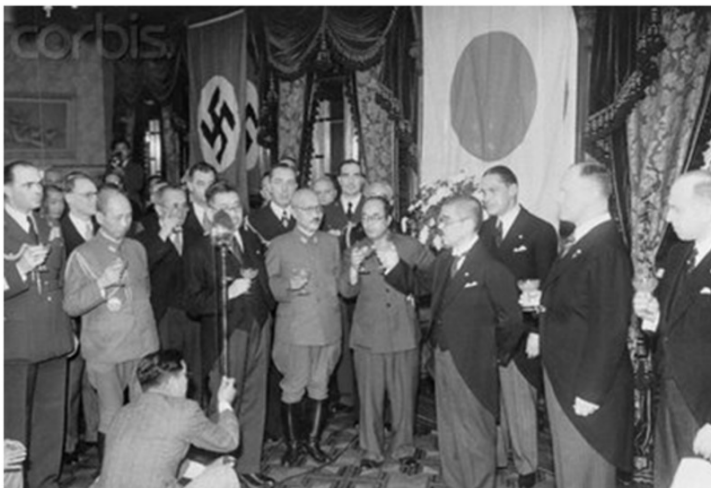
Celebrating the tripartite pact in Tokyo

On August 1, 1940, Foreign Minister Matsuoka Yōsuke announced the government's policy to build a so-called "Greater East Asia Co-prosperity Sphere." The term Greater East Asia implied that in addition to the core region of Japan, Manchukuo, and China, the sphere would include Southeast Asia, Eastern Siberia, and possibly the outer regions of Australia, India, and the Pacific Islands. The new policy to expand the boundaries of Japan's empire beyond East Asia emerged after France and the Netherlands fell to Nazi Germany in the late spring of 1940 and forfeited their colonies in Southeast Asia. Japan subsequently advanced into French Indochina in June 1940. Three months later in September 1940, Japan concluded the Triple Axis Pact with Germany and Italy. When diplomacy failed to lift economic sanctions imposed by the United States, Japan attacked Pearl Harbor on December 8, 1941. These actions set the country on a course of brutal occupation of Asia and a destructive war against the United States and its allies that culminated in Japan's total defeat in 1945.