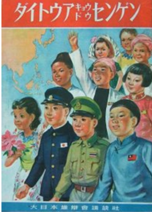
The future of the Co-Prosperity Sphere

At the same time, the current battle was depicted as a "war of construction" ( kensetsu sensō ) in which Japan was building a Grossraumwirtschaft reflecting