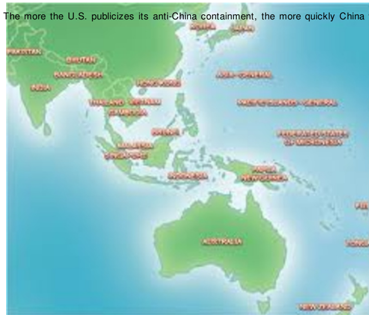
Map shows relative distance of Australia and Okinawa from China