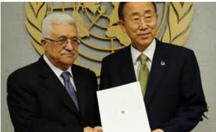
Palestinian President Mammoud Abbas with UN Secretary General Ban Ki-moon

Since then, however, there has been a backlash against the extreme anti-Islam policy of the United States in the form of an anti-U.S., anti-Israel Islamist movement; since the revolution in Egypt last spring, Islamism has been accelerating under the rubric of democratization. Previously pro-Israel Egypt and Turkey have since turned anti-Israel, and the Palestinian Authority, once a puppet of the U.S. and Israel, is increasingly defiant in its attempt to gain United Nations membership. Even in formerly secular Tunisia and Morocco, the Islamists are rising in the elections .