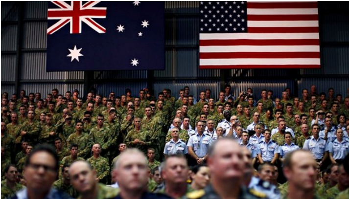
American Marines and Australia Soldiers listen to Obama address in Darwin, Australia

In his remarks to the Australian parliament on November 17, President Obama declared that the U. S. was making the Asia-Pacific region a top priority. While promising a continued U.S. military presence in the region, Obama also expressed his intention to strengthen U.S.-China cooperation. This declaration, however, was made at the same time as Obama announced a series of anti-China measures: to station U.S. forces permanently in Australia for the first time, to promote the Trans-Pacific Partnership (TPP) – a multilateral trade agreement that excludes China – and to discuss the South China Sea Islands at the ASEAN summit, to Beijing's displeasure. Therefore, the Japanese media view Obama's emphasis on Asia as strengthening an anti-China containment ring.