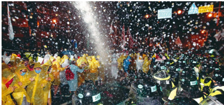
Police use water cannons to prevent citizens walking toward the Yeongdo Shipyards