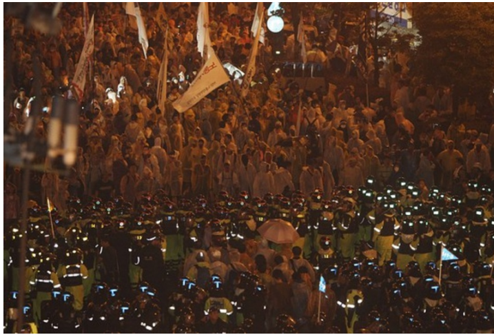
Police block demonstrators marching towards the shipyard of Hanjin Heavy Industries in Busan on July 10, 2011