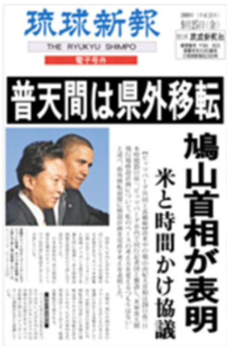
Hatoyama informs Obama of the Kengai Isetsu Policy

Hatoyama's proposition instantaneously thrust kengai isetsu as an intelligible political claim into public consciousness. Which governor of a Japanese prefecture, he asked, was willing to accept a US military base in place of Okinawa? 16 Due to the disproportionately small number of US military bases in Japanese prefectures other than Okinawa, few Japanese politicians or citizens had directly confronted the meaning of the US-Japan Security Treaty. However, with Hatoyama effectively dropping the base problem on each governor's doorstep, many citizens were forced to confront the reality of the Treaty from which they benefit. Are you willing to pay dues for the US-Japan Security Treaty rather than continuing to exploit Okinawa Prefecture by imposing 75% of the burden there?