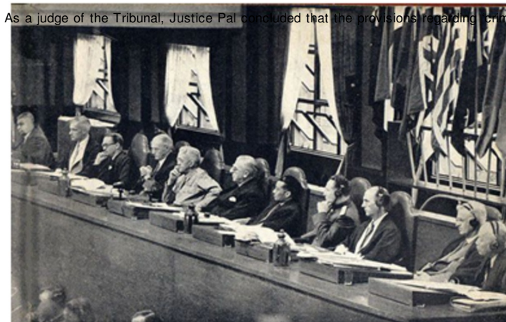
The Justices (Pal on the left)

As a judge of the Tribunal, Justice Pal concluded that the provisions regarding 'crimes against peace' and 'crimes against humanity' were ex post facto laws and violated the prohibition on non-retroactivity in international law. Further, Pal examined the historical process on the 'overall conspiracy' which the prosecution defined as a premise of the alleged 'crimes against peace', and criticised the prosecutors' arguments. He intended to prove that so-called 'crimes against peace' were invalid both from jurisprudential and historical perspectives.