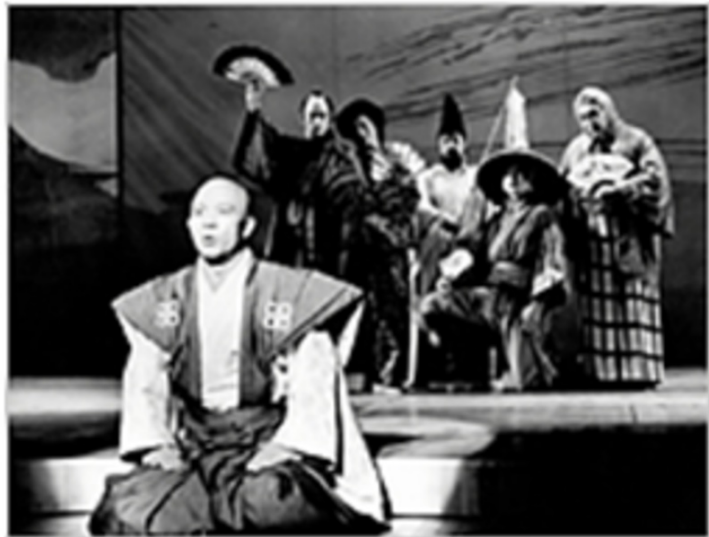
Mako playing the Reciter in "Pacific Overtures" on Broadway, 1976