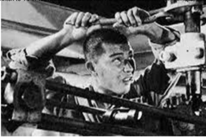
Po-han in The Sand Pebbles

switch to TV in 1951, was considered non-PC and was dropped, first, perhaps, because the two creators of the original radio show in 1928, Freeman Gosden