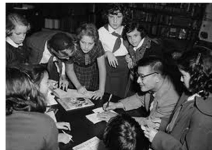
Book signing for children

How did African Americans break through? It was thanks, no doubt, to the civil rights movement that came to an active head in the 1960s. Their