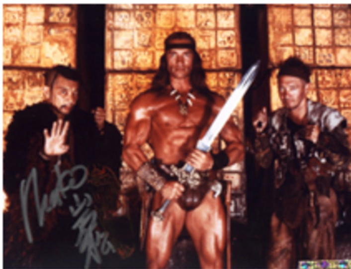
"The Sorcerer" with Schwarzenegger as Conan