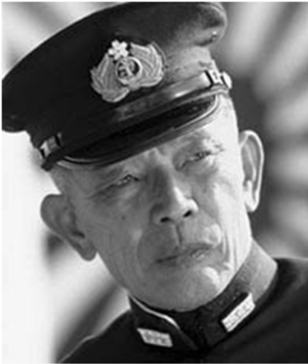
Mako as Adm. Yamamoto