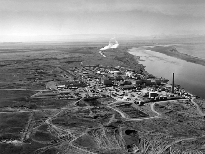
Hanford reactors along the Columbia River, 1960

A reactor for producing plutonium was established at Hanford in the northwestern United States. The greatest waste product generated by this reactor was an enormous quantity of heat. Hanford discharged this heat into the Columbia River, and it was Admiral Hyman Rickover, the “Father of the Nuclear Navy,” and the Electric Boat Company who first realized that this heat could be used as a source of engine propulsion power for submarines.