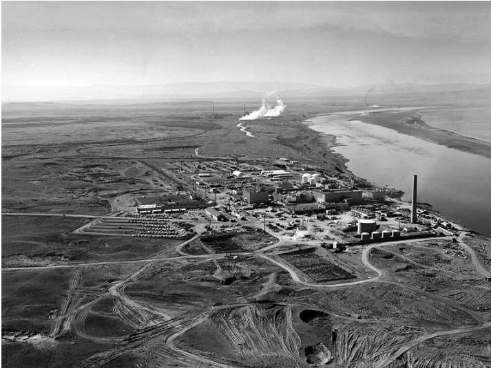
Hanford reactors along the Columbia River, 1960

A reactor for producing plutonium was established at Hanford in the northwestern United States. The greatest waste product generated by this reactor was an enormous quantity of heat. Hanford discharged this heat into the Columbia River, and it was Admiral Hyman Rickover, the “Father of the Nuclear Navy,” and the Electric Boat Company who first realized that this heat could be used as a source of engine propulsion power for submarines.