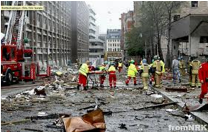
The Oslo bombing