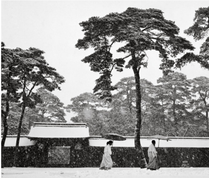
Werner Bischof created images that shape our perception of Japan even now. Meiji-Shrine (1951)

Interviewed by Finn Canonica and Birgit Schmid of the Swiss weekly Das Magazin