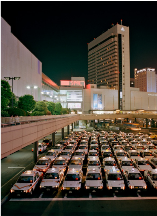
System and order have top priority in Japan